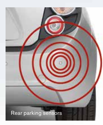
The CDX eases into and out of tight parking spaces, thanks to its rear parking sensors. Audible warnings indicate the proximity of potential obstacles.