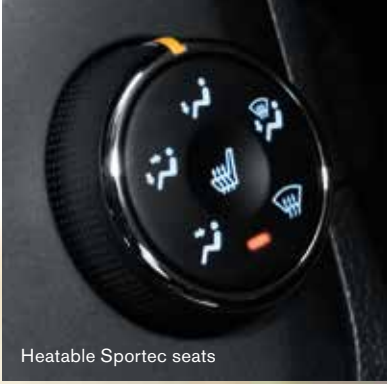
If you hate the cold, you will warm to the idea of electronically heated front seats.