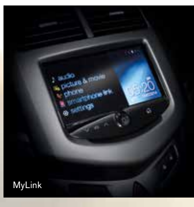
Holden MyLink offers new levels of convenience and flexibility by bringing smartphone capabilities into your vehicle.