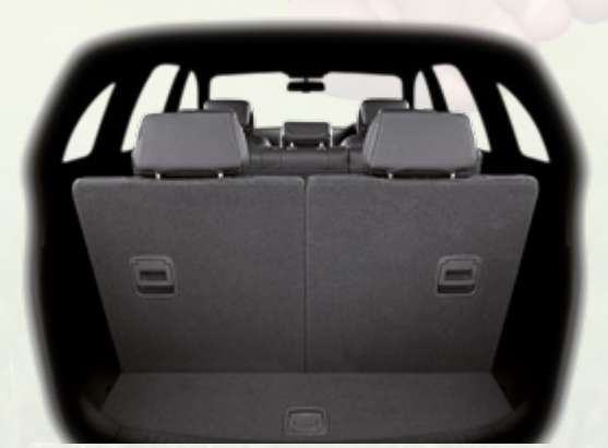
Flexible storage options