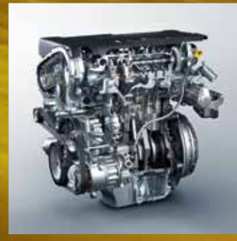
▲ 2.0L 4-cylinder common-rai turbo diesel engine^