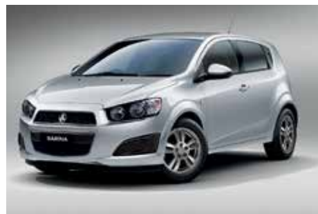
Nitrate Silver (available on CD and CDX only)