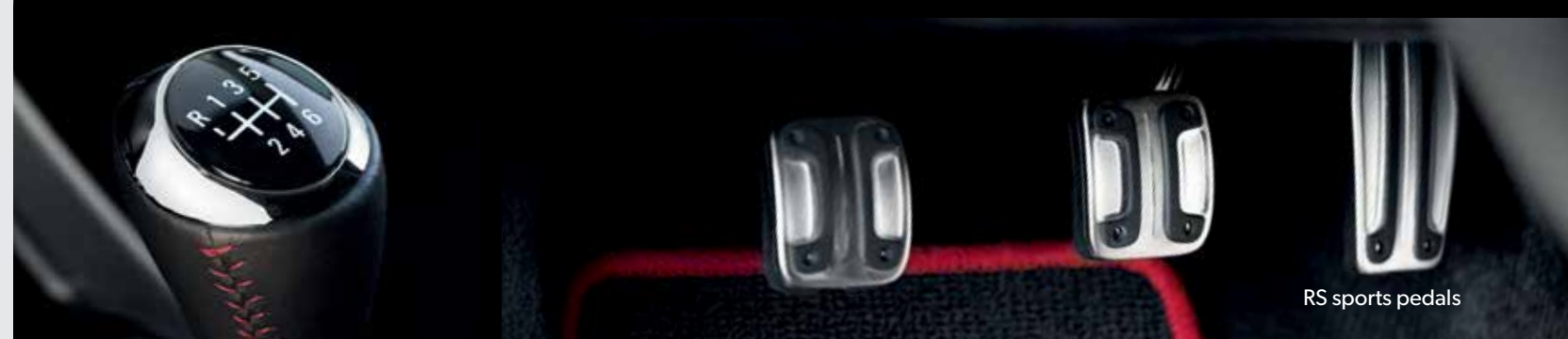
RS sports pedals