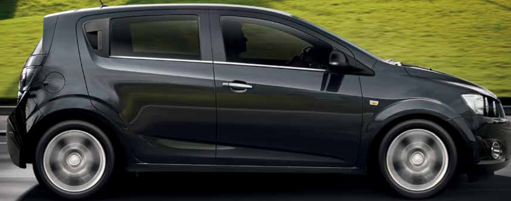
Barina CDX Hatch in Carbon Flash Black

The sporty, yet sophisticated stance of the Holden Barina is an exciting expression of European styling. Available in Hatch or Sedan, it's fresh and modern from every angle, with slick alloy wheels, eye-catching exposed headlights and on the Hatch, uniquely designed hidden rear door handles.