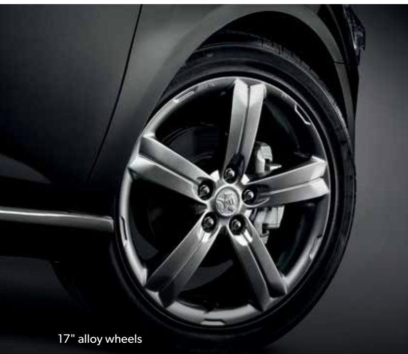
17" alloy wheels