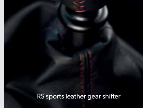
RS sports leather gear shifter