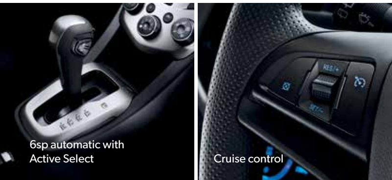
6sp automatic with Active Select