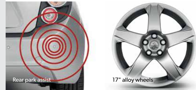
Rear park assist