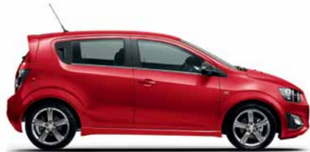
Barina RS in Blaze Red

Amped up from the inside out, Barina RS is begging you to hit the road and never look back. The turbo-charged engine is amplified by a lowered and stiffened suspension with performance-tuned dampers and a unique sports exhaust. This is the Barina, but not as you know it.