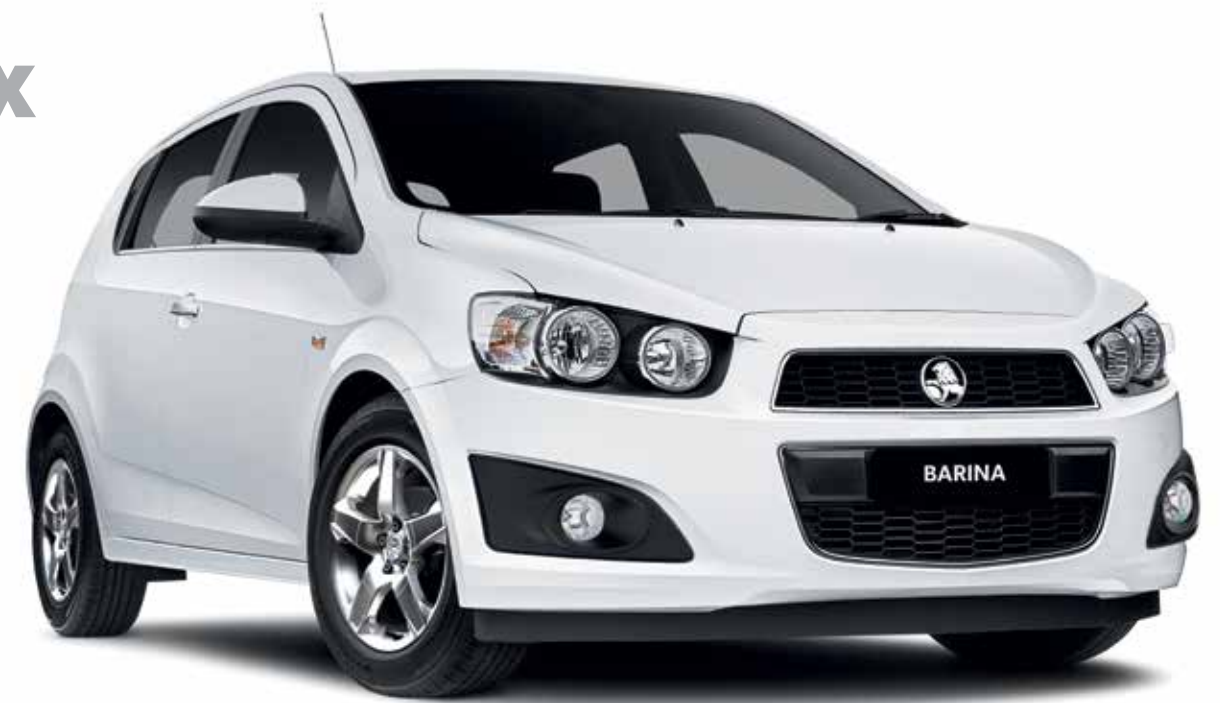
Barina CDX Hatch in Summit White