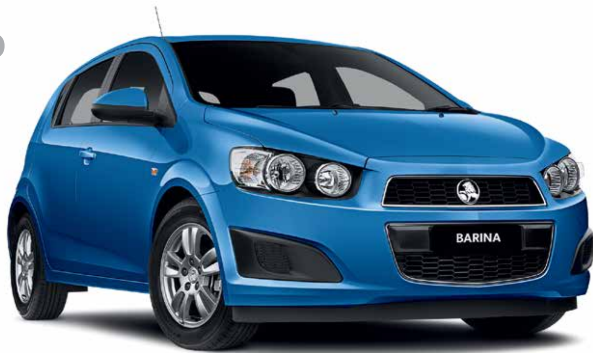
Barina CD Hatch in Boracay Blue