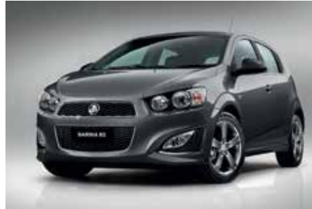
Son of a Gun Grey