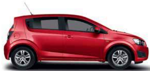
Barina CD Hatch in Blaze Red

The Holden Barina CD welcomes you with an invitingly spacious interior. Intelligently designed storage spaces ensure all your belongings are within easy reach.