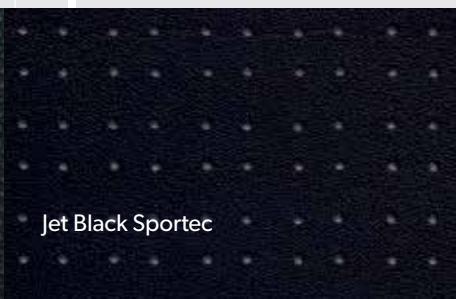
Jet Black Sportec