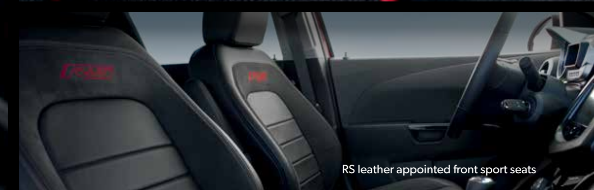
RS leather appointed front sport seats