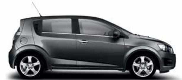
Barina CDX Hatch in Son of a Gun Grey