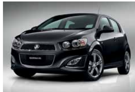
Carbon Flash Black