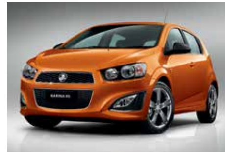
Orange Rock (available on RS only)