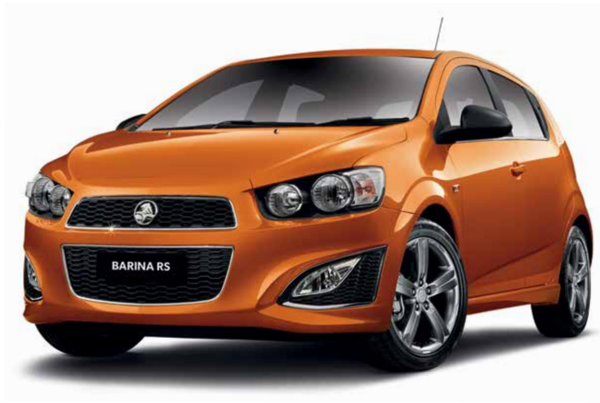
Barina RS in Orange Rock