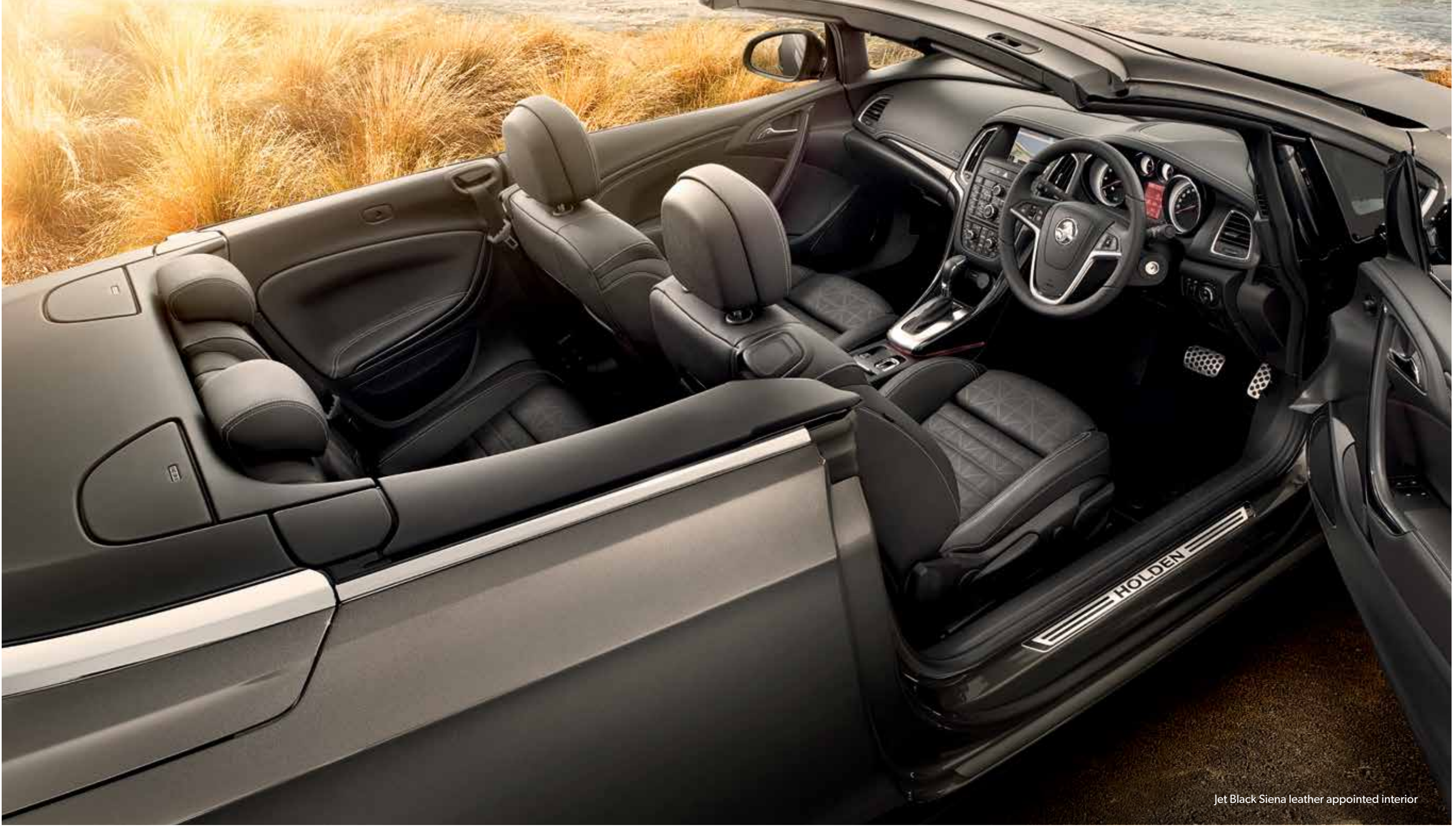
Below: Stitched and wrapped dashboard reflects the high-end luxury finish throughout