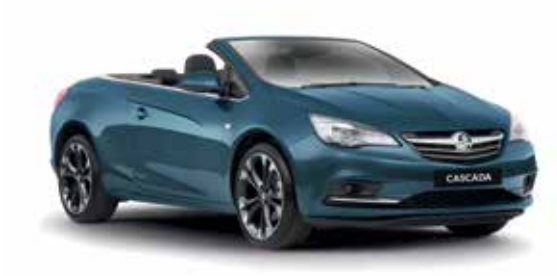
Deep Sky Blue