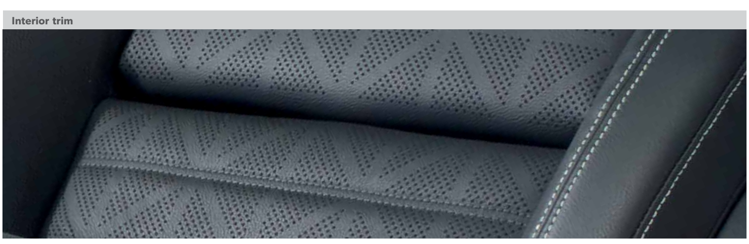
let Black Siena leather appointed interior