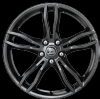
20" SV RAPIER FORGED ALLOY WHEEL IN DARK STAINLESS (OPTIONAL)