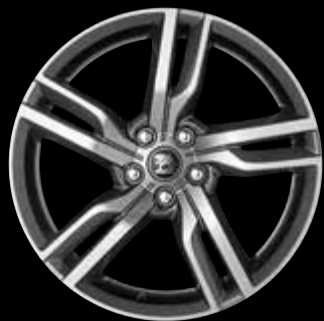
20" ALLOY WHEEL WITH MACHINED FACE AND MAGNETIC GREY ACCENTS