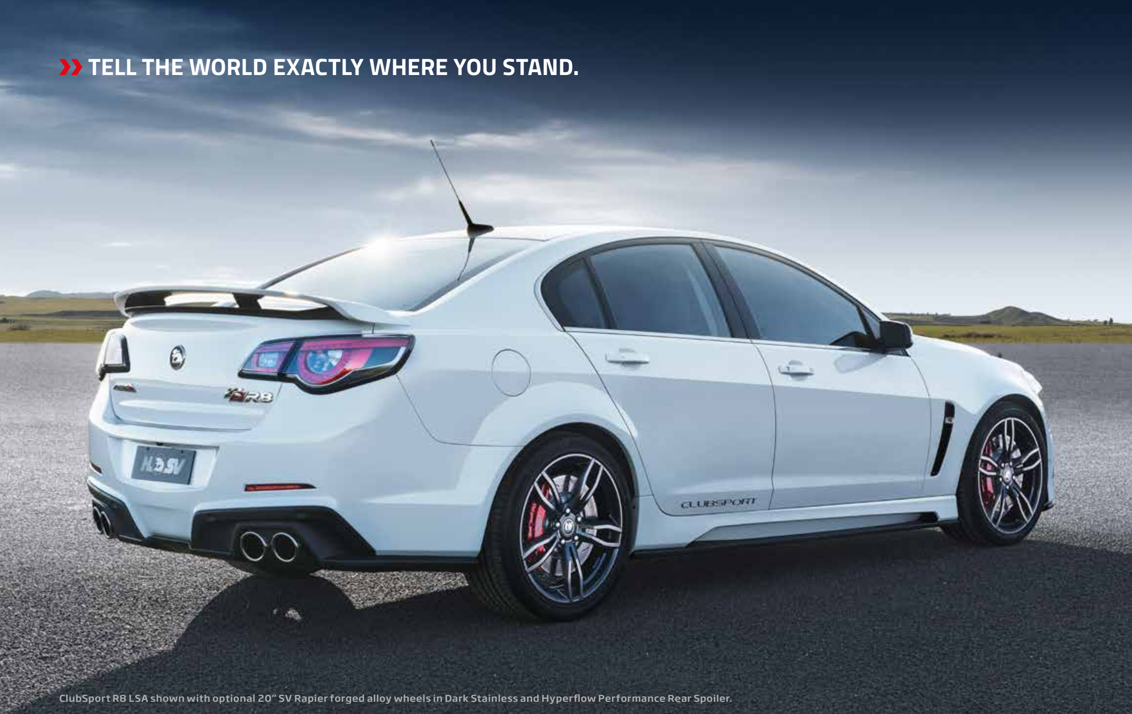
ClubSport R8 LSA shown with optional 20" SV Rapier forged alloy wheels in Dark Stainless and Hyperflow Performance Rear Spoiler.

»» TELL THE WORLD EXACTLY WHERE YOU STAND.