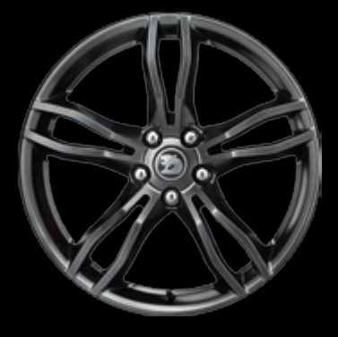
20" SV RAPIER FORGED ALLOY WHEEL IN DARK STAINLESS (OPTIONAL)

20" ALLOY WHEEL WITH MACHINED FACE AND MAGNETIC GREY ACCENTS