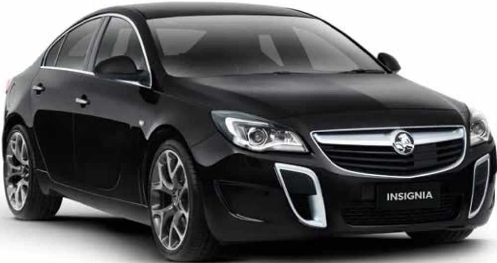
Insignia in Carbon Flash Black

With Nürburgring-honed performance and leading technology all standard, Insignia sets a new mid-sized benchmark.