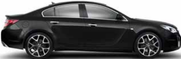
Carbon Flash Black