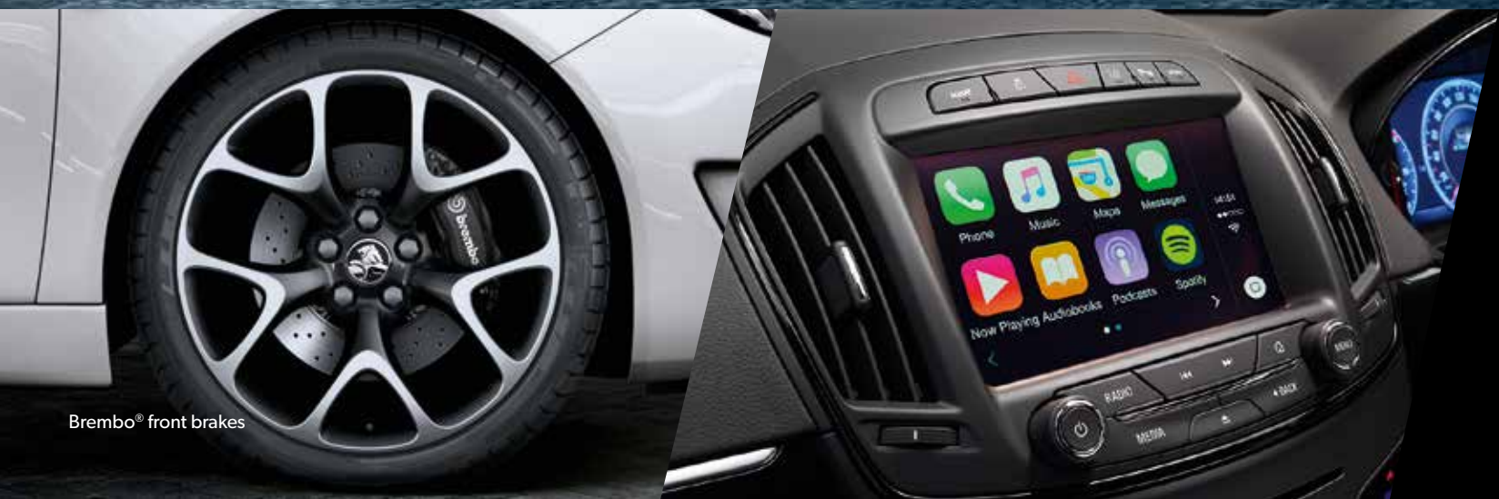
Brembo® front brakes

German design and engineering. The very latest state-of-the-art technology. Insignia perfectly balances brains and brawn. Handling and performance has been honed at the Nürburgring, and backed by race-bred Brembo® front brakes and leather appointed Recaro® front sports seats. Make a statement with Insignia VXR sedan.