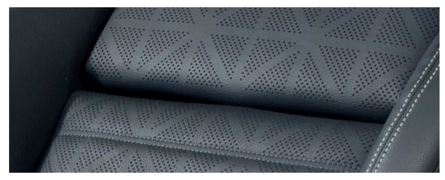
Jet Black Siena leather appointed interior

Variations between colours shown and actual paint colours/interior trim colours may occur due to the printing process. Certain colours may not be available from time to time *Prestige paints are available at an additional cost