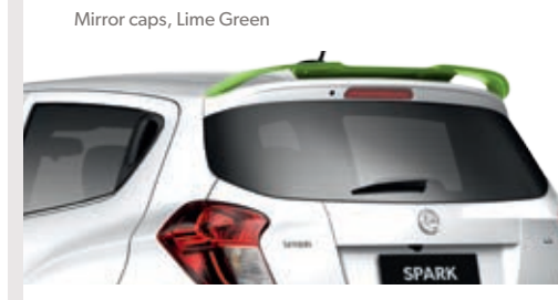
Spoiler, Lime Green