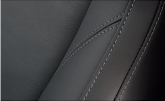
LTZ Black leather-appointed