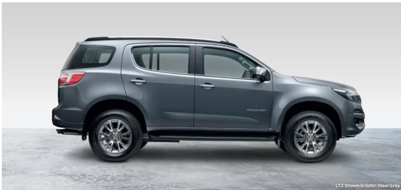
LTZ Shown in Satin Steel Grey