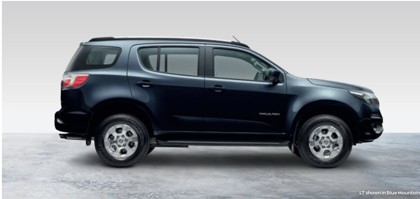
LT shown in Blue Mountain