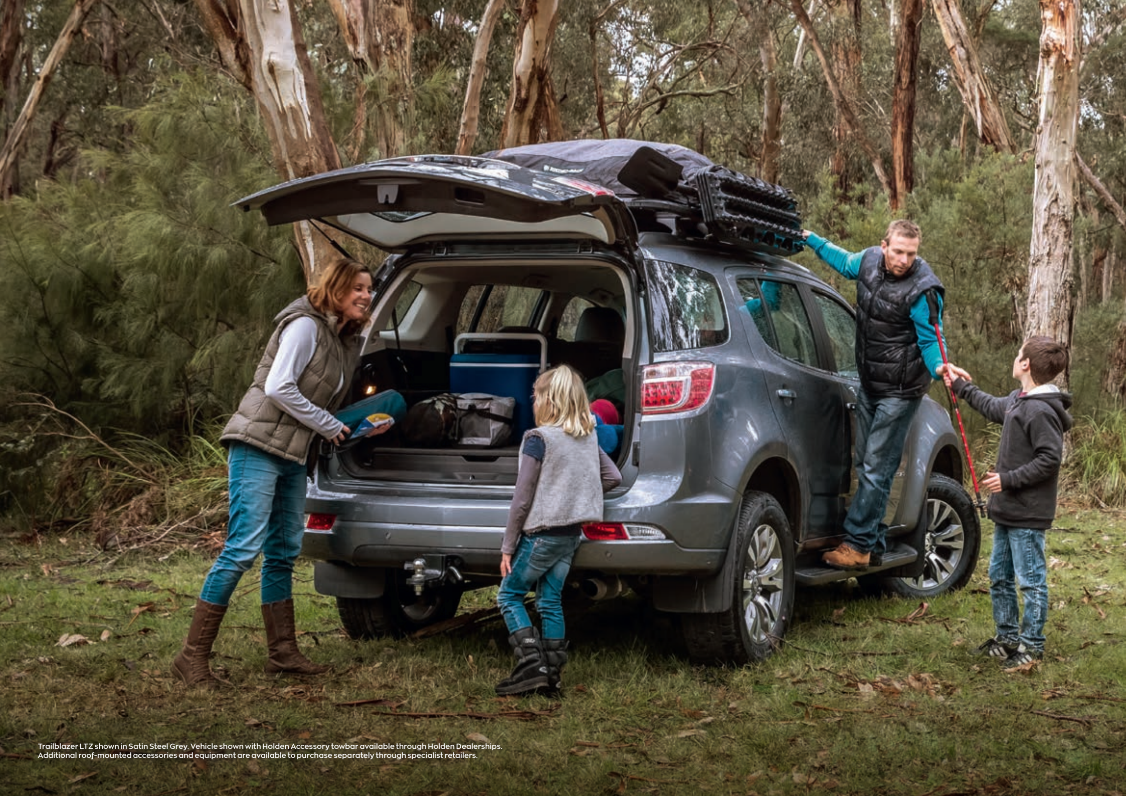
Trailblazer LTZ shown in Satin Steel Grey. Vehicle shown with Holden Accessory towbar available through Holden Dealerships. Additional roof-mounted accessories and equipment are available to purchase separately through specialist retailers.