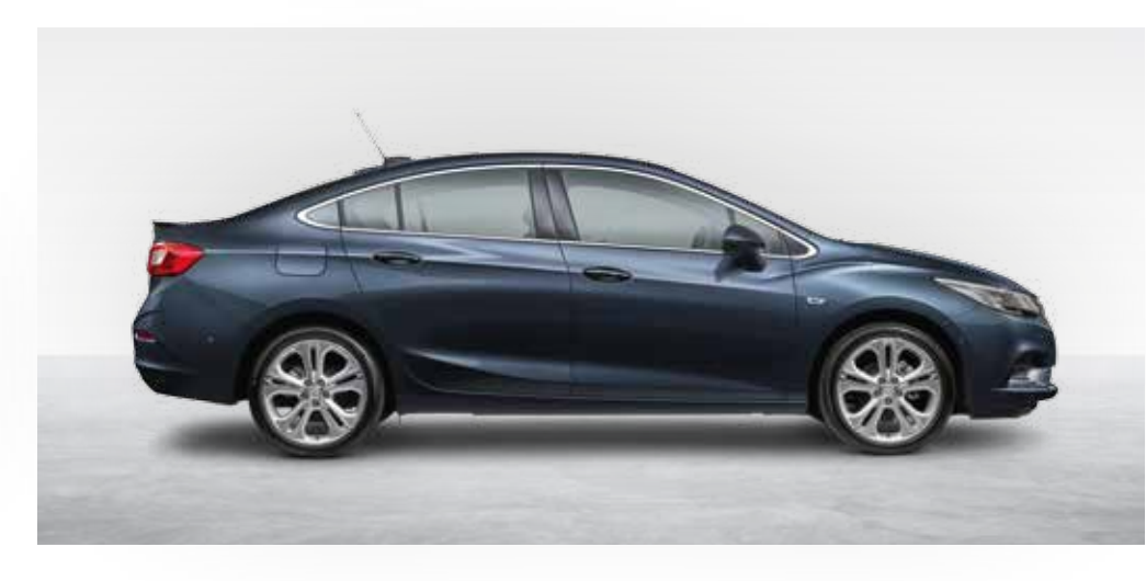
Old Blue Eyes