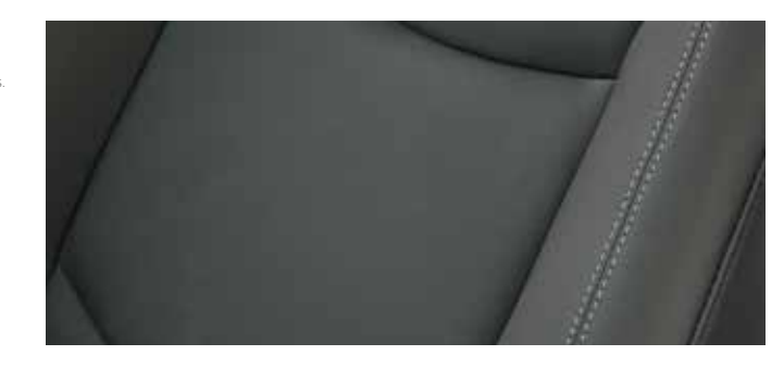
Jet Black leather-appointed trim