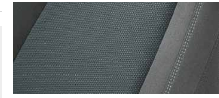
Jet Black cloth trim

*Prestige paints are available at an additional cost and certain colours may not be available from time to time. Variations between colours shown and actual paint colours/interior trim colours may occur due to the printing process. Actual vehicle colours may appear different under certain light conditions. Trim patterns are not to scale. Indicative only. Customers are encouraged to contact their Holden Dealer for current colour availability.