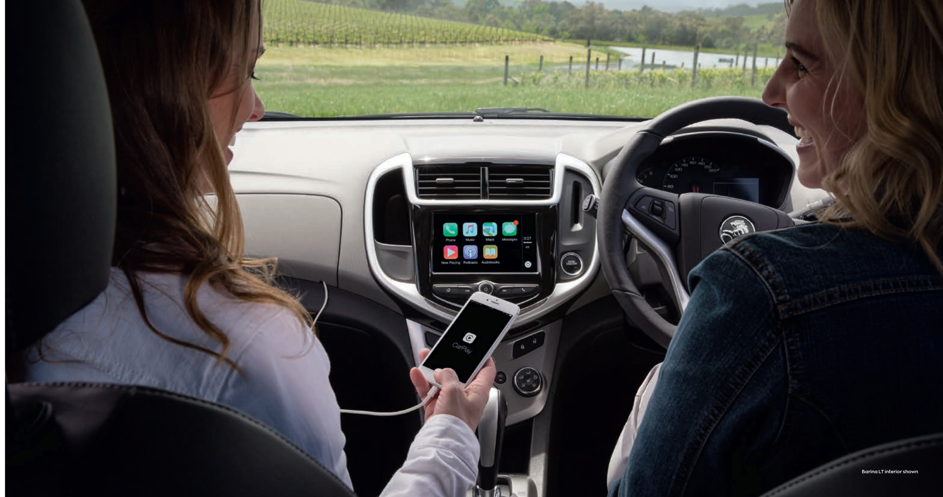
Barina LT interior shown

2 Requires compatible iOS device. See apple.com.au for details. 3 Requires compatible Android ® device. See android.com for details.