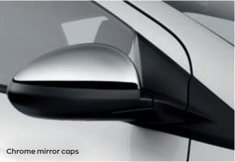
Chrome mirror caps