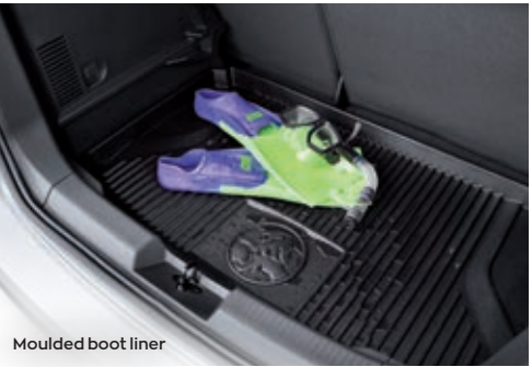
Moulded boot liner