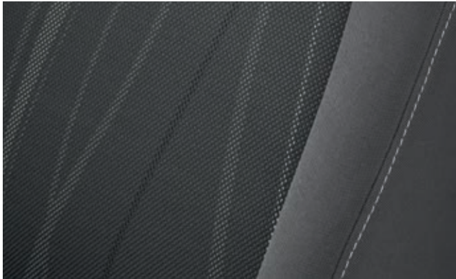
Jet Black cloth with Silver accents

Variations between colours shown and actual paint colours/interior trim colours may occur due to the printing process. Certain colours may not be available from time to time. *Prestige paints are available at an additional cost