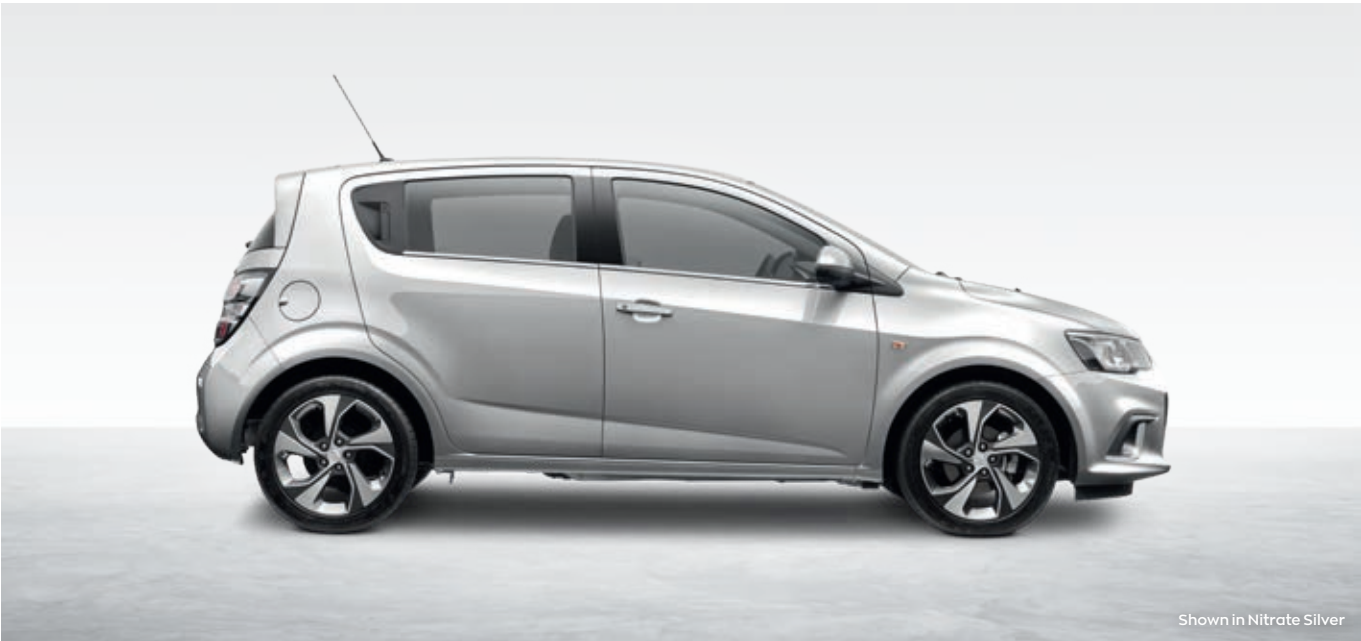
Shown in Nitrate Silver