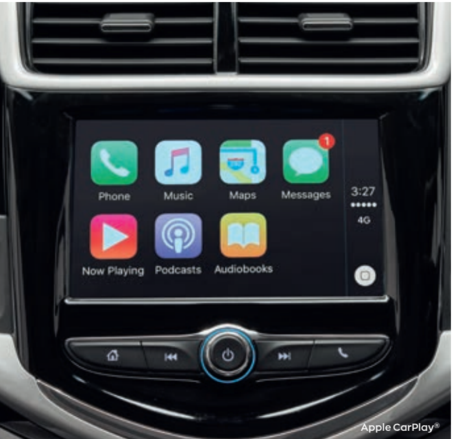
Apple CarPlay ®