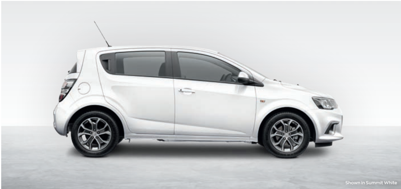
Shown in Summit White