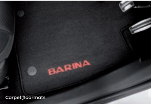
Carpet floor mats