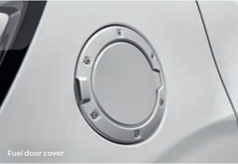
Fuel door cover