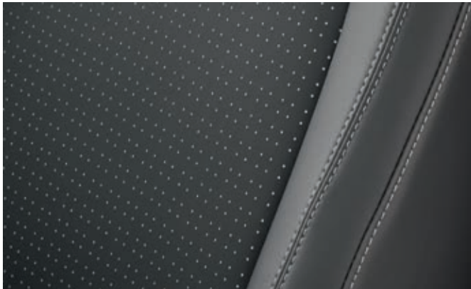
Jet Black Sportec