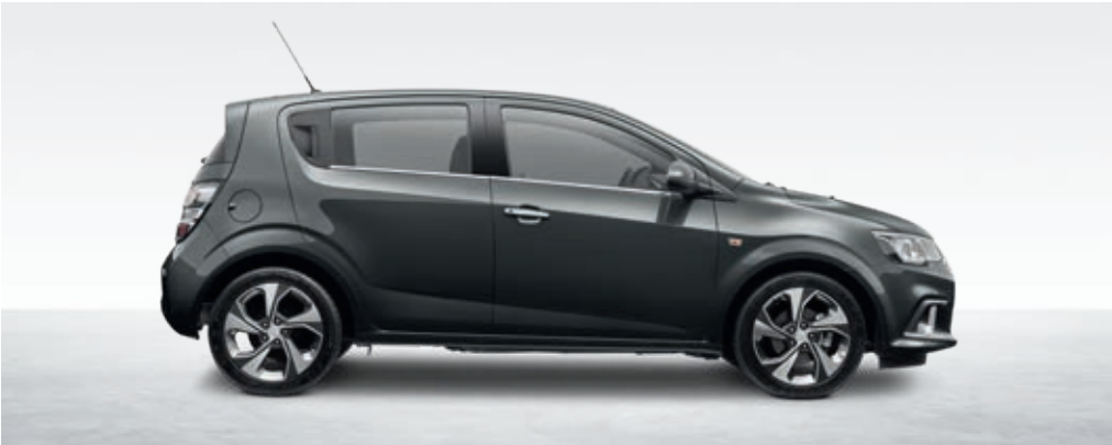
Son of a Gun Grey*