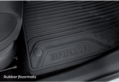
Rubber floor mats