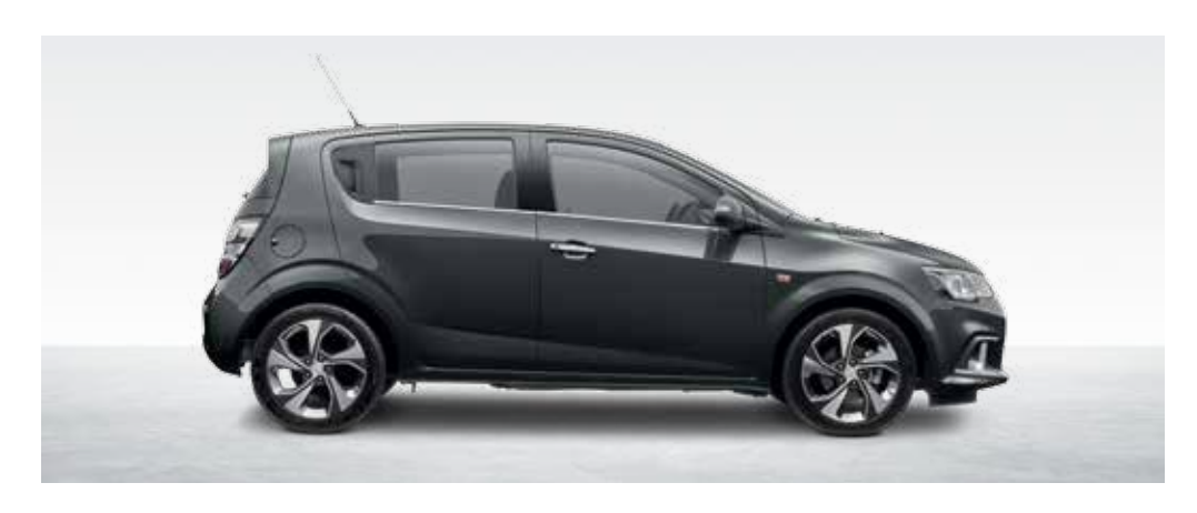
Son of a Gun Grey