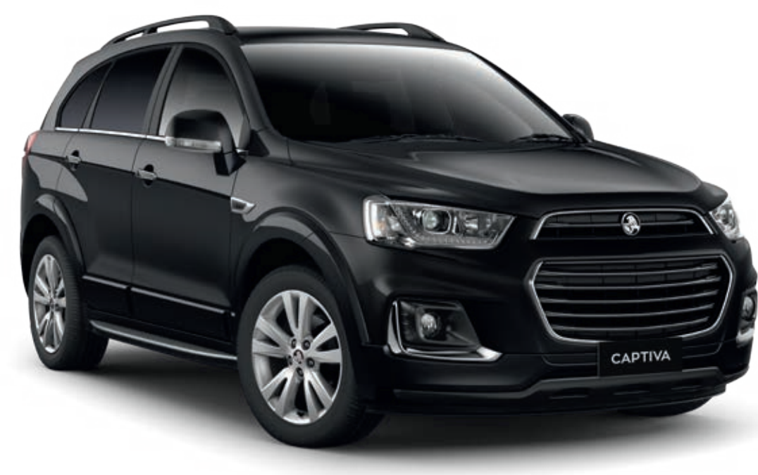
Captiva LT in Mineral Black