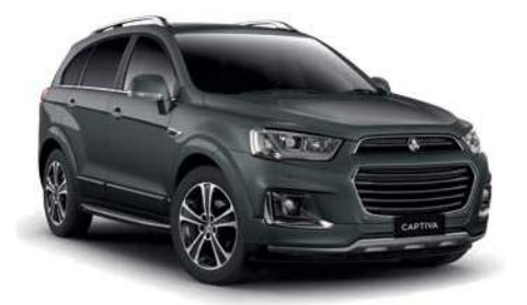
Son of a Gun Grey