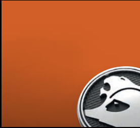
LIGHT MY FIRE