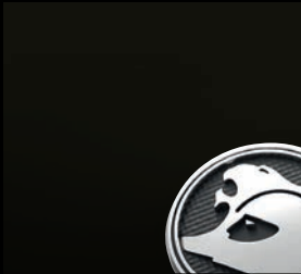
SON OF A GUN