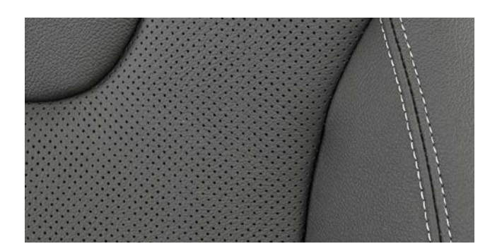
Jet Black leather-appointed trim (perforated)