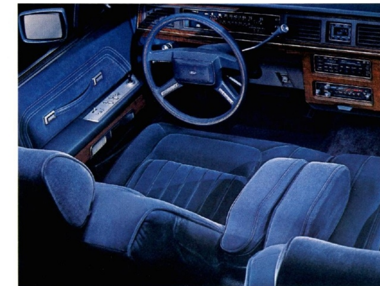
LTD Crown Victoria LX interior in Shadow Blue.

In 1988, the tradition of full-size comfort continues. LTD Crown Victoria Wagon. LTD Country Squire with classic woodtone paneling.