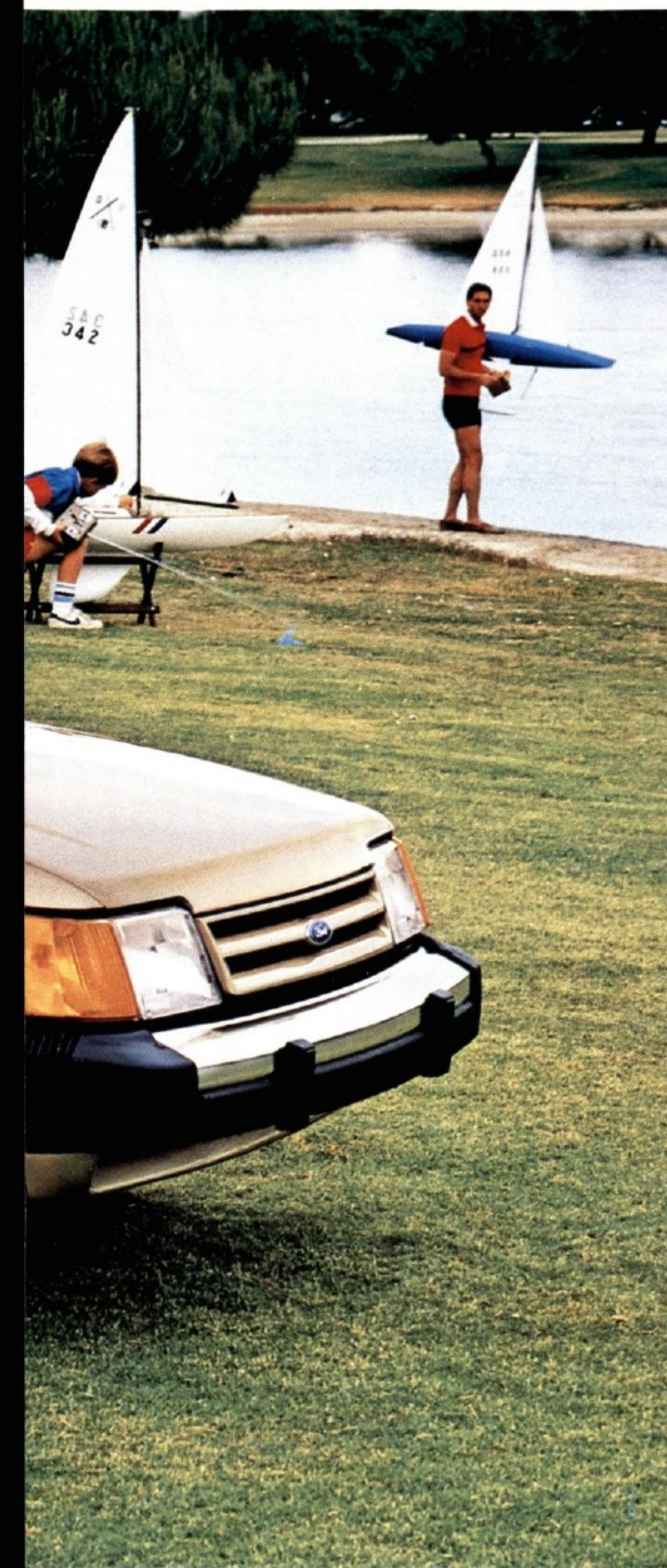
Escort GL Wagon in Driftwood Clearcoat Metallic.

F ord Escort has been the world's best-selling car for five straight years.* Much of this phenomenal success is certainly owed to the attributes of the Escort wagon model.