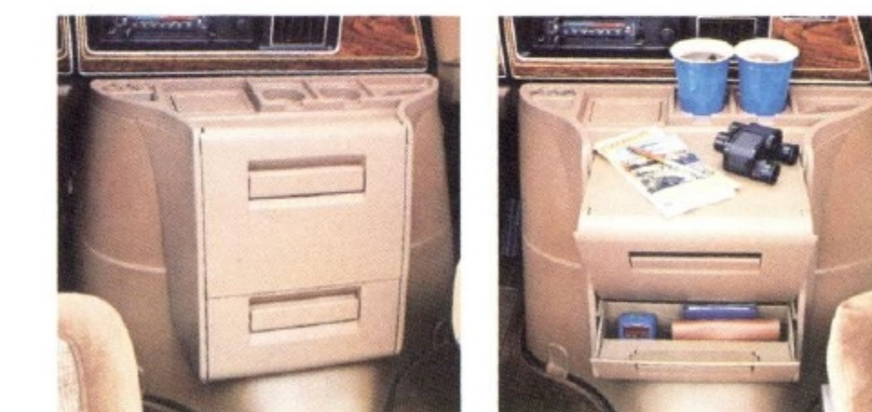
The new optional engine cover console includes concealed storage compartments, cup holders, snack tray and coin holder.