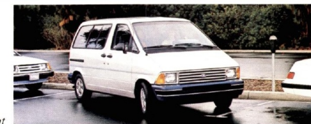
With its short length and power rack-and-pinion steering, Aerostar has outstanding maneuverability.

Some equipment shown on these pages may be optional.