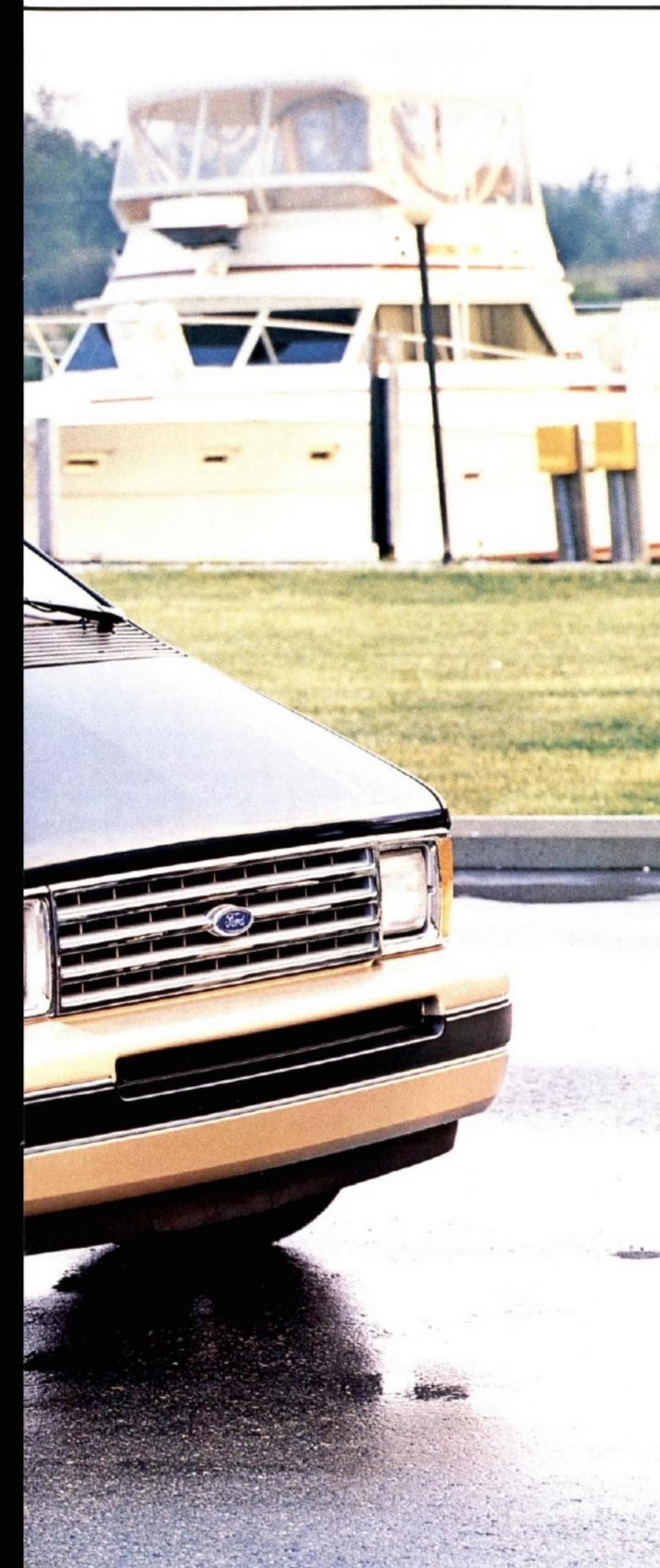
Eddie Bauer Aerostar Wagon in Deep Shadow Blue Clearcoat Metallic over Light Chestnut Clearcoat Metallic.

F or a lot of people today, Aerostar Wagon is the ideal passenger van for family travel. Aerostar can accommodate up to seven passengers in the comfort of a spacious environment.