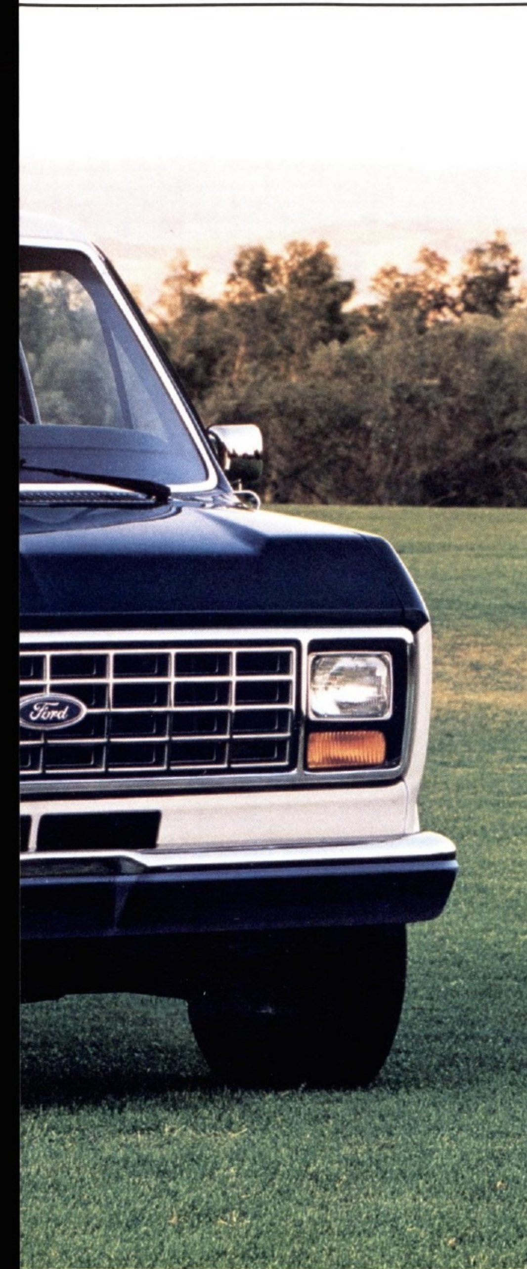
Club Wagon XLT in Deluxe Two-Tone Deep Shadow Blue Metallic and Colonial White.

I n Club Wagon you have all the benefits a full-size passenger van provides. Exceptional spaciousness and comfort. Great performance. Outstanding versatility.