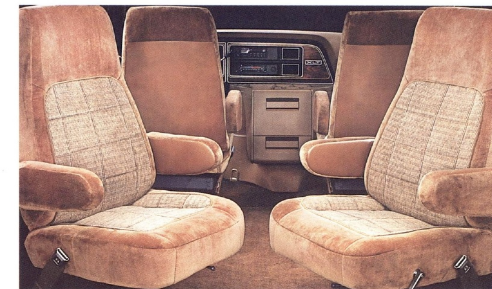
Club Wagon XLT interior in Chestnut. Rear Captain's Chairs are optional.

Ford Club Wagon for 1988. Remarkably spacious and comfortable. And Built Ford Tough!