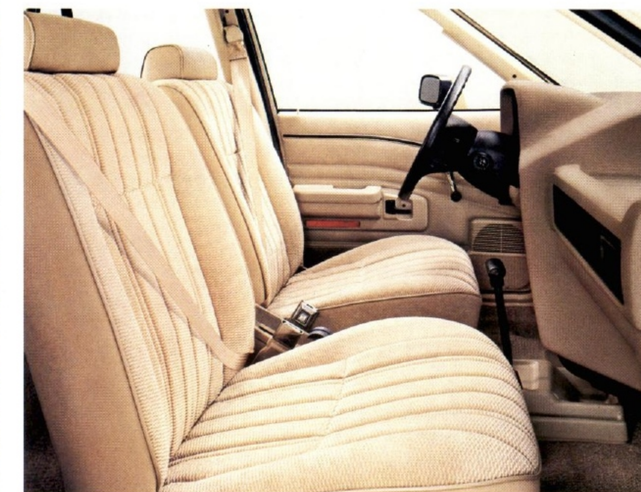
Escort GL interior in Sand Beige. The shoulder belts are shown as they would be positioned with the automatic shoulder belt restraint system activated.

*Based on 1982-1986 calendar year worldwide sales and export data.