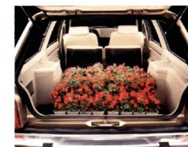
Escort Wagon provides 28 cu. ft. of cargo volume, and 58.8 cu. ft. with the rear seat folded down (optional split dual fold-down rear seats shown).

Some equipment shown on these pages may be optional.