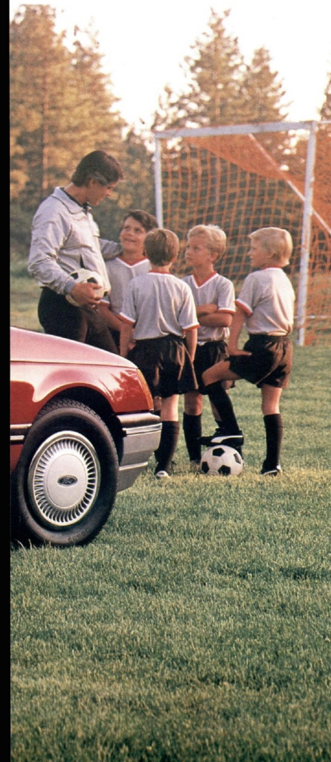
Taurus GL Wagon in Medium Red Clearcoat Metallic.

F ord Taurus is the most aerodynamic wagon in its class, and provides a cargo volume index — 80.7 cu. ft. with the second seat lowered — that is larger than most other mid-size wagons built in America.* Inside and out, Taurus Wagon is truly remarkable in design.