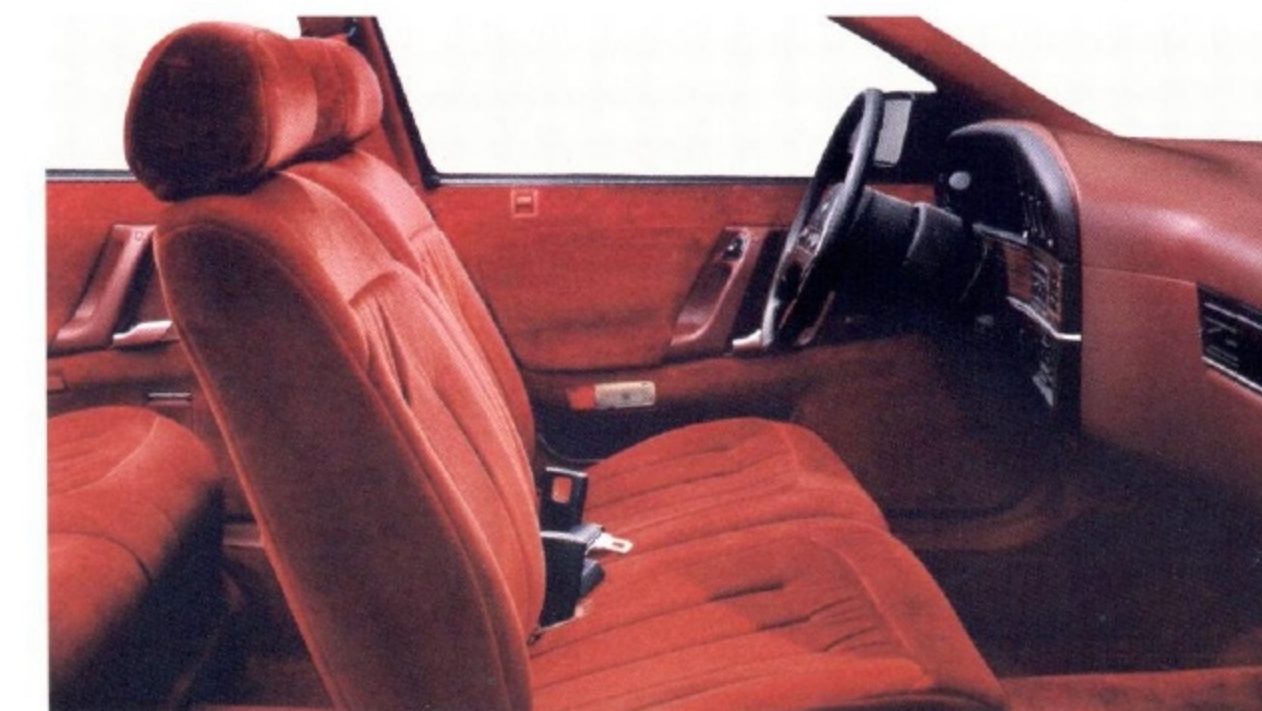
Taurus LX interior in Scarlet Red.

*Excluding other Ford Motor Company products.