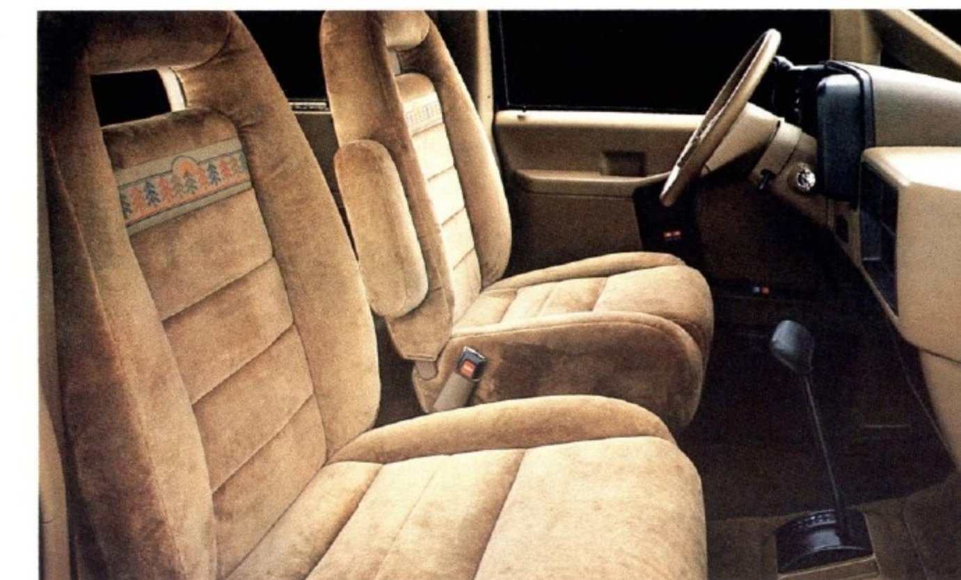
Eddie Bauer Aerostar interior with front Captain's Chairs in Chestnut.

*Reduced by passenger and cargo weight in the towing vehicle.