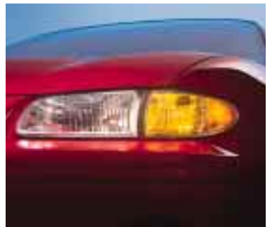
The reflector optic headlamps are as functional as they are stylish, using chrome optical parabolic reflector surfaces to focus the beam.