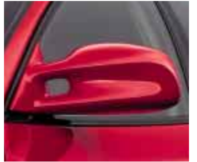
The twin post sideview mirrors are stable and aerodynamically sound. The extra large mirror area provides excellent rear vision.

that has to be driven to be fully admired.