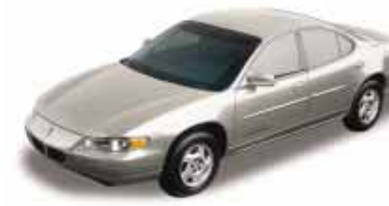
17 – Silvermist Metallic