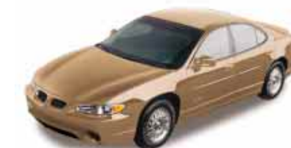
60 – Topaz Gold Metallic