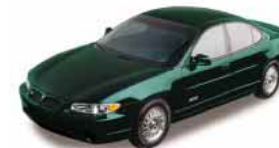
34 – Dark Forest Green Metallic