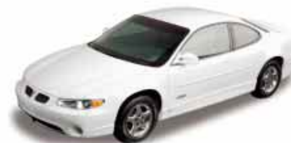
16 – Arctic White

Colours may not be exactly as illustrated due to restrictions of printing process. Please see your sales consultant for specific colour and model availability.