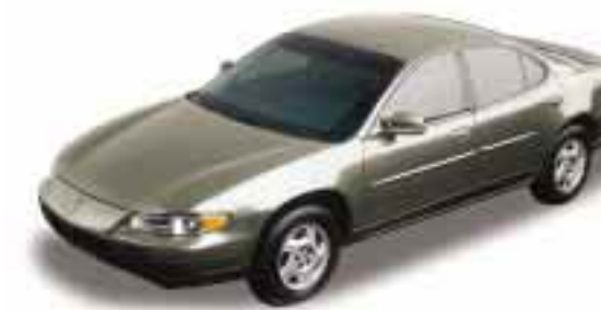
47 – Gray Green Metallic*