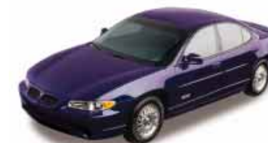
89 – Medium Purple Metallic