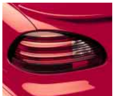
Even the taillamps on the Grand Prix are treated with a unique and defining style, highlighted by a ribbed configuration.