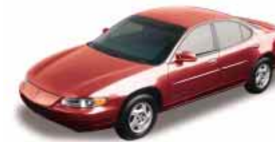
53 – Medium Red Metallic*