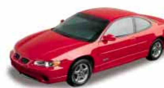
81 – Bright Red