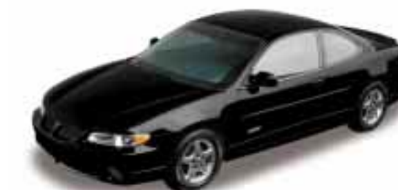
41 – Black