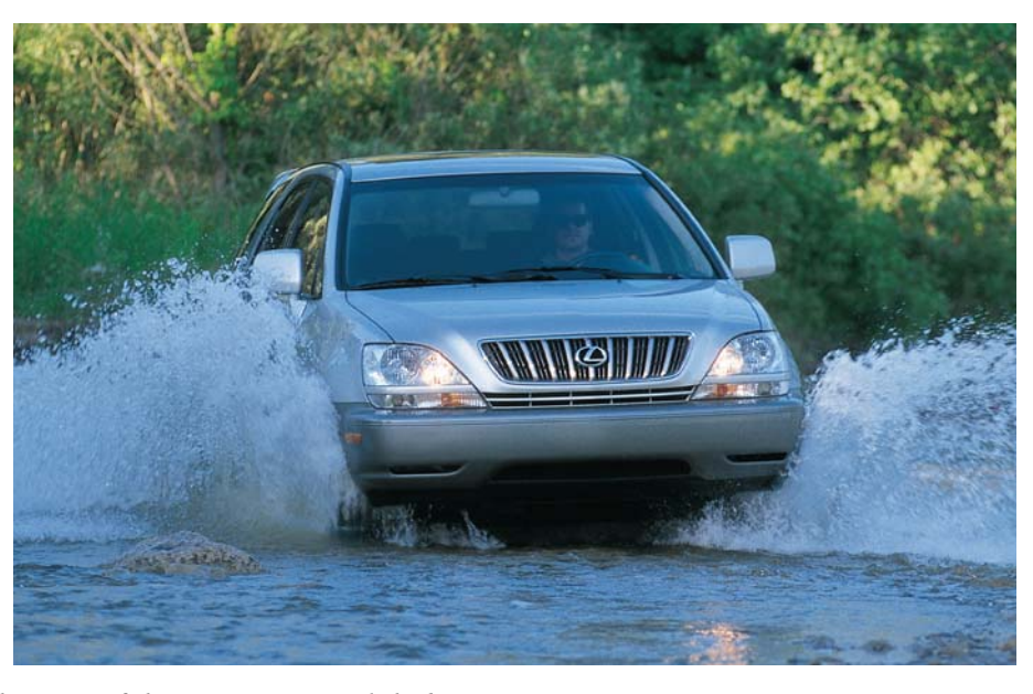
Below left: The awesomely smooth and even quieter, faster and more agile, incredibly luxurious Lexus flagship, the LS 430. Below right: The new-generation ES 300 mid-size luxury sedan. Above: The mid-sized (and first "civilized") SUV. the RX 300.

Stradivarius, saying, "Some things just can't be expressed in numbers. In the end, the character of the GS was accomplished in much the same way a piano must be tuned – with human senses".