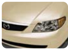
Light Sandalwood Metallic