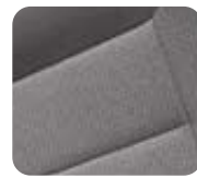
Casual Grey Cloth