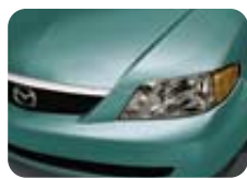
Seabreeze Green Mica