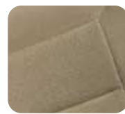
Elegant Beige Cloth