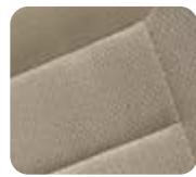
Casual Beige Cloth