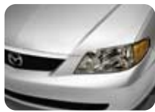
Sunlight Silver Metallic