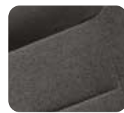
Elegant Grey Cloth