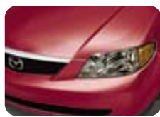
Millennium Red Mica