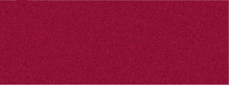
Redondo Red Pearl