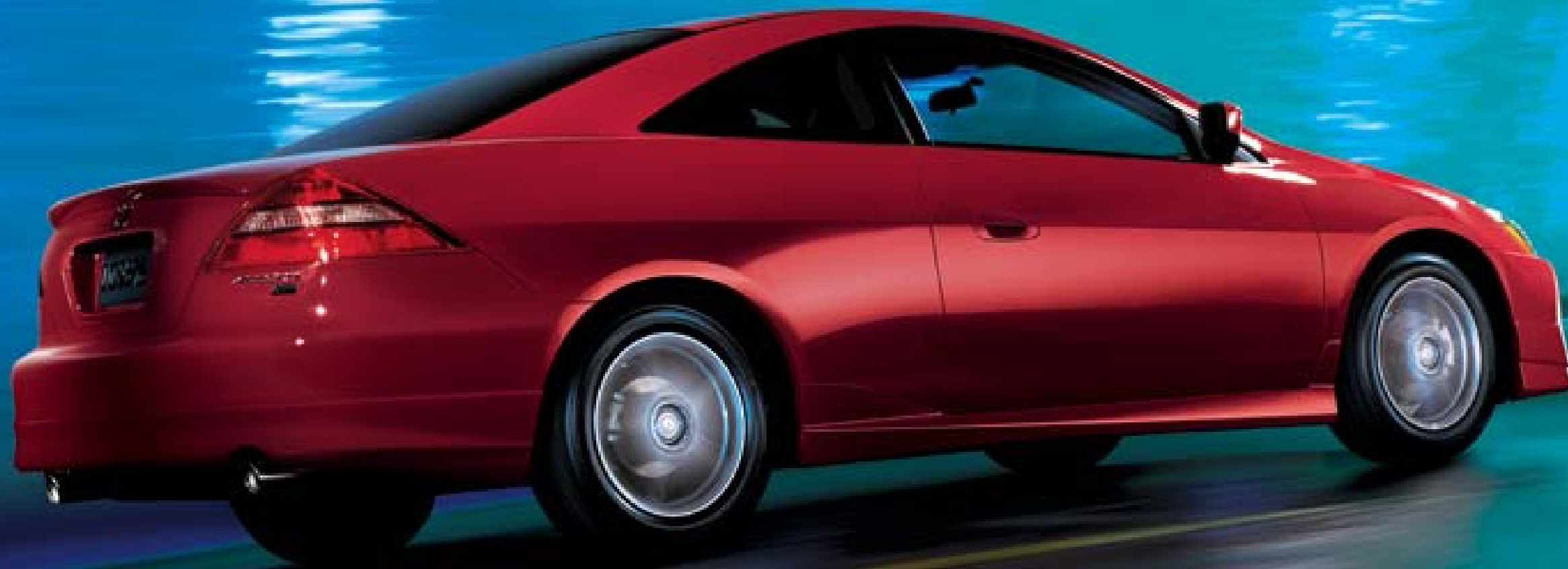
Accord EX-V6 Coupe shown in Redondo Red Pearl with accessory front/rear/side skirts, rear lip spoiler and chrome exhaust finishers.