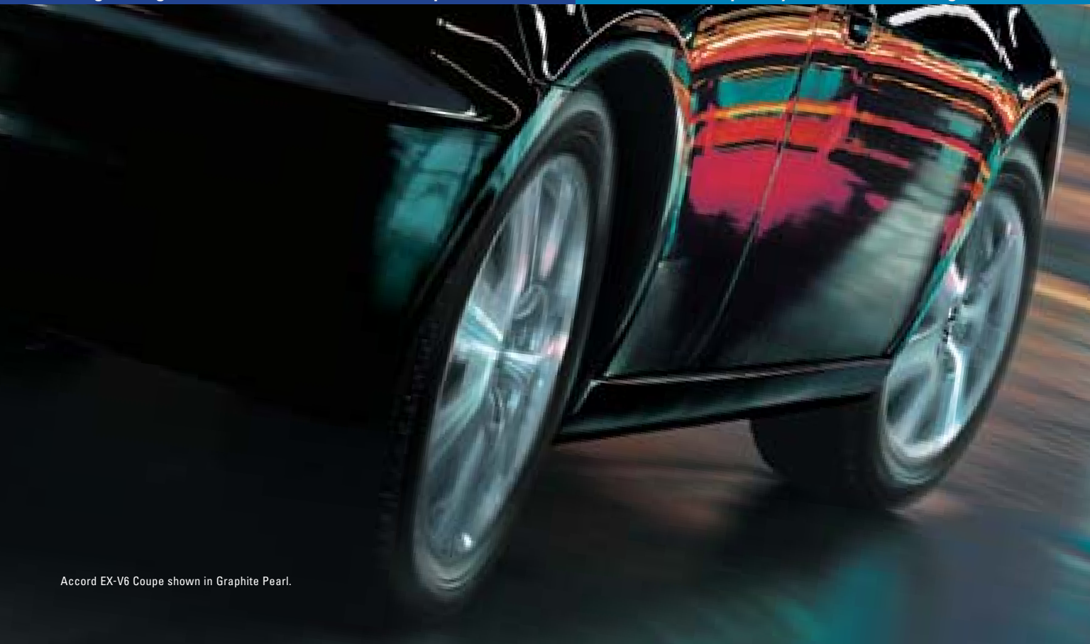
160-hp, 4-cylinder i-VTEC™ engine

Accord EX-V6 Coupe shown in Graphite Pearl.