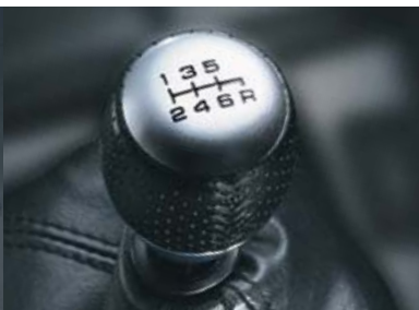
Transmissions ▶ 5-speed automatic / 5- &amp; 6-speed manuals