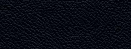
Black Leather (EX-L, EX-V6)