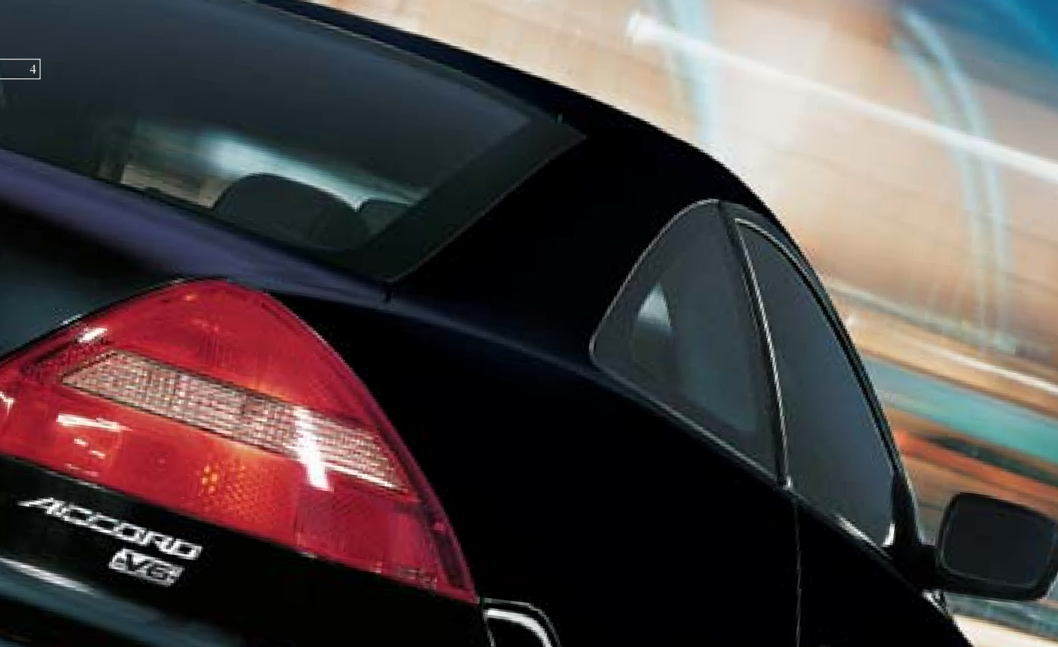
Lightweight aluminum blocks, heads &amp; pistons