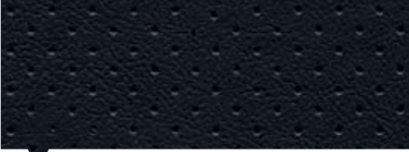
Black Leather (EX-V6 6-speed)