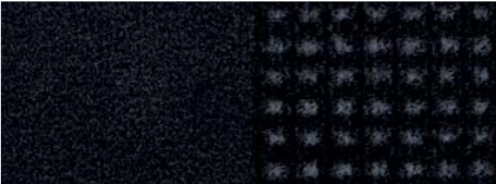
Black Fabric (LX-G)