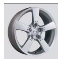
18" alloy wheels