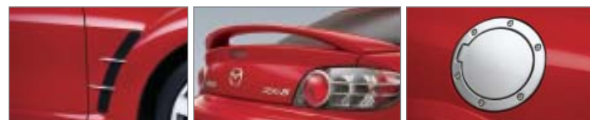
Pictured above from left to right: Air outlet garnishes (aluminum), rear spoiler, aluminum fuel-filler door (pearl satin).