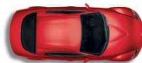
VELOCITY RED MICA