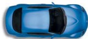
WINNING BLUE MICA