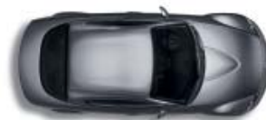
GALAXY GREY MICA