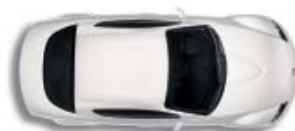
SNOW FLAKE WHITE PEARL