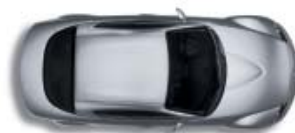
SUNLIGHT SILVER MICA