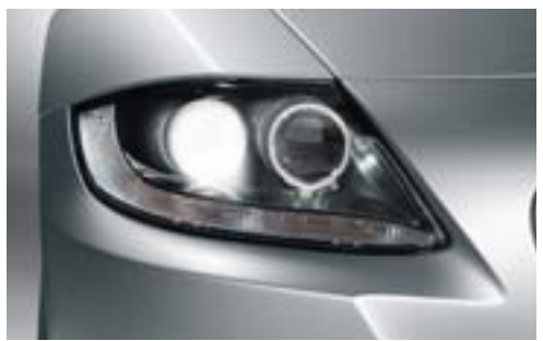
■ Xenon headlights for low and high beam with dynamic headlight range control ensure better illumination of the road ahead and to the side, in bad weather or in poor visibility. Xenon headlights with ellipsoid technology offer a very high standard of light intensity and a very smooth and consistent spread of light on the road.