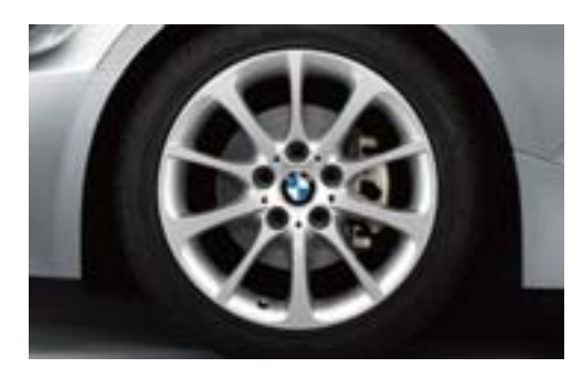
■ BMW Star Spoke light-alloy wheels – Style 200, 17 x 8.0, 225/45R-17. (Available only on the BMW Z4 3.0i.)