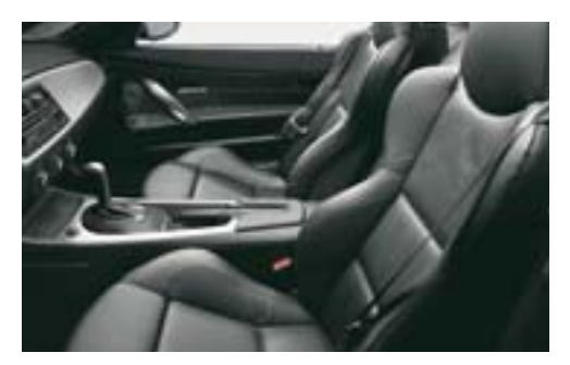
☐ M Sport seats for driver and front passenger: sporty design with integrated headrests; optimum lateral support in dynamic driving situations provided by highly contoured seat sides; wide range of seat length settings; individual adjustment for seat height, thigh support and seat angle. (Optional on the Z4 3.0si only.)