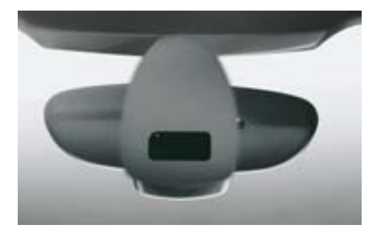
■ Rain sensor with automatic headlights uses an infrared light to measure the amount of rain. When the wipers are in the intermittent mode, the rain sensor automatically adjusts the windshield wiping interval as needed.