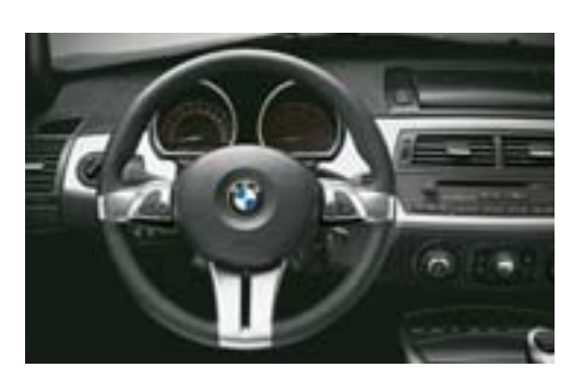
■ Multi-function leather sport steering wheel, control of radio and telephone (optional) via integrated buttons.