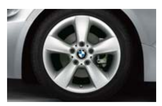
■ BMW Star Spoke light-alloy wheels – Style 105, 17 x 8.0 front, 225/45R-17, 17 x 8.5 rear, 245/40R-17. (Available only on the BMW Z4 3.0si.)