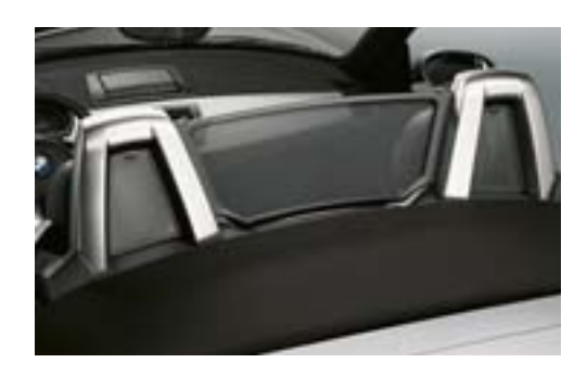
☐ The wind deflector reduces drafts and isolated turbulence in the shoulder and neck region; consists of two panes securely fitted into the roll bars and a frame-based net spanning between them. If the net is not required, it can be stored in a special storage rack in the luggage compartment.

☐ Fully automatic softtop operation: At the touch of a button, the softtop opens/closes in approximately 10 seconds. The softtop can also be operated via remote control. (Standard on the Z4 3.0si.)