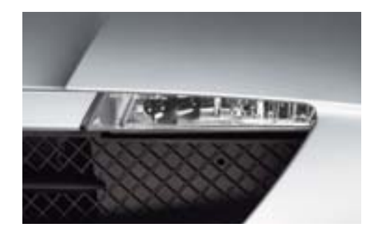
■ Foglights integrated into the front air dam. The foglights provide extra safety in bad weather conditions.