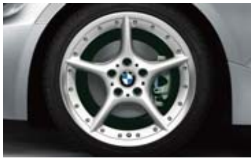
☐ BMW Star Spoke bolted alloy wheels – Style 108, 18 x 8.0, front 225/40R-18, 18 x 8.5 rear, 255/35R-18. (Available only on the BMW Z4 3.0si.)