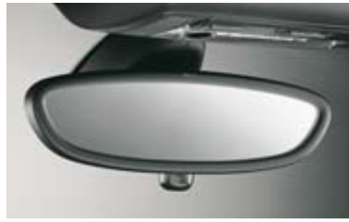
☐ Auto-dimming mirrors increase your driving safety and comfort at night. Depending on the glare intensity, the interior and exterior mirrors dim accordingly in order to minimize glare. When glare has ceased, the mirrors return to the original degree of reflection.