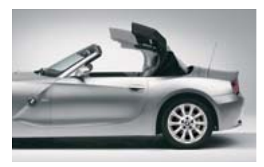
■ Manual softtop operation: Central lock for singlehanded operation.

☐ Fully automatic softtop operation: At the touch of a button, the softtop opens/closes in approximately 10 seconds. The softtop can also be operated via remote control. (Standard on the Z4 3.0si.)