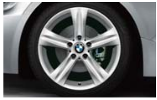
☐ BMW Star Spoke light-alloy wheels – Style 203, 18 x 8.0 front, 225/40R-18, 18 x 8.5 rear, 225/35R-18. (Available only on the BMW Z4 3.0i.)