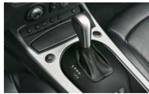
☐ Six-speed automatic gearbox with Steptronic<sup>®</sup>. Steptronic enables you to select gears manually. via the steering wheel-mounted shift paddles.