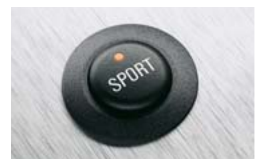
☐ Dynamic Driving Control with Sport Mode can be activated with the touch of a button. In Sport Mode, handling is crisper and the engine responds even more vigorously. Steering assistance is also reduced for improved feel of the road, and cruise control also accelerates faster.