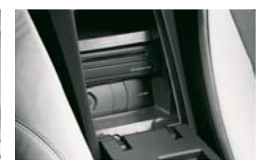
☐ 6-disc CD Changer is integrated into the storage compartment and can hold up to six CDs (shown in combination with Navigation System).