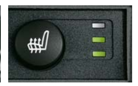
☐ Seat heating for the driver and passenger is a welcome feature in cooler weather. With the touch of a button, you can individually select from three heat settings. (Standard on the Z4 3.0si.)