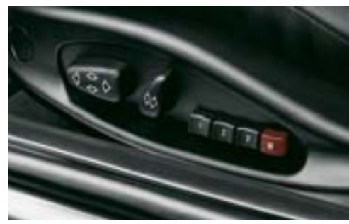
☐ Electric seats with driver memory enable the driver and passenger to precisely adjust their seats to individual preferences.