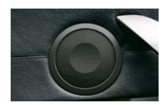
☐ HiFi Sound System, THX-certified with Digital Sound Processing (DSP), 430 watt amplifier, seven-band equalizer, eight speakers and two subwoofers, provides an excellent sound. Carver technology produces an especially brilliant bass playback at low volumes.