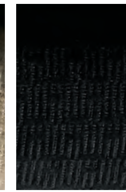
19C - Ebony Cloth