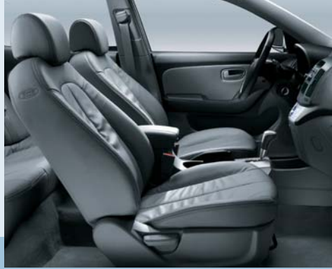
With more space than most cars in its class, the 2007 Elantra has room to carry all types of cargo.

Let the comfort of heated front seats welcome you on cold mornings. They come standard on GL Comfort, GL Comfort Plus, GL Sport and GLS models.