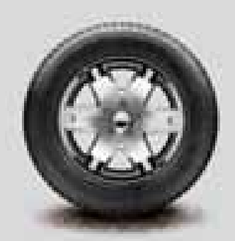
17-inch Oasis Chrome-Clad Cast Aluminum | Available