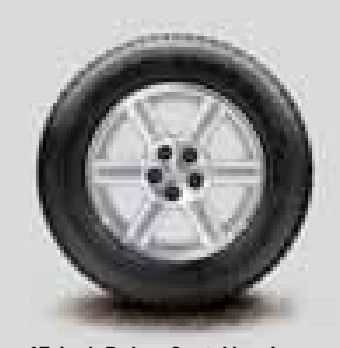
17-inch Dakar Cast Aluminum painted Sparkle Silver | Standard