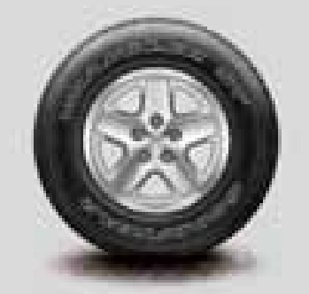
16-inch Mechanica Cast Aluminum painted Sparkle Silver | Available