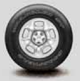
16-inch Full-Face Steel painted Argent | Standard