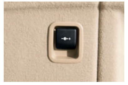
■ Sockets (12V), one each in the front storage bin, rear centre console, rear (utility box), and in the luggage compartment.