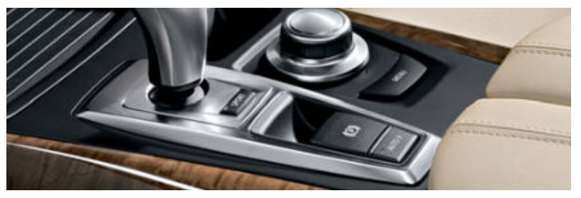
Parking brake with Auto-Hold function, allows you to hold and release the vehicle most conveniently by means of a button in the central console. Sport button to select a firmer suspension setting (available in conjunction with Adaptive Drive).