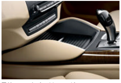
■ Knee pads, for driver and front passenger, ensure greater comfort and lateral support – especially when cornering at speed.