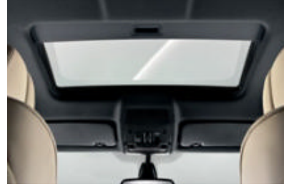
■ Glass sunroof, electric, with integral sun protection, comfort opening and closing via vehicle key and fingertip control.