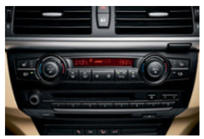
■ Automatic Climate Control, 2-zone, including Automatic Air Recirculation (AAR) with circulation filter, sun and condensation filters, and automatic temperature control (separate for driver and passenger), as well as air volume control.