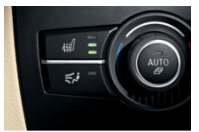
Seat heating for driver and front passenger: seat surfaces and backrests with heating in three stages for pleasant temperatures shortly after setting off.