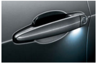
■ Lights package includes rear reading lights, rear footwell lights, indirectly lit door pockets and inside door handles, exit lights, and proximity illumination in the outside door handles. This ensures that the area around the door is evenly lit when the door is open, making getting in and out easy and safe (optional on the BMW X6 xDrive35i).