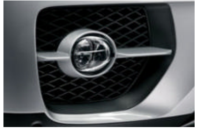
■ Foglights, integrated in the front air dam, ensure extra safety in poor visibility. Cornering lights are incorporated into the foglights, providing illumination at an angle of up to 90° to the vehicle when cornering. This allows pedestrians and cyclists to be better seen.

Adaptive Headlights, including cornering lights, illuminate bends by optimal electromechanical adjustment of the swivelling headlights as soon as the driver turns the steering wheel.