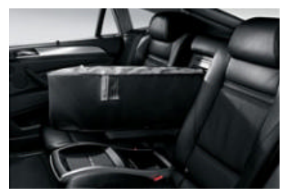
□ Ski Bag for clean and safe transport of up to four pairs of skis with up to four occupants in the vehicle. Whenever the Ski Bag is not required, it remains stored conveniently and out of sight behind the centre armrest.