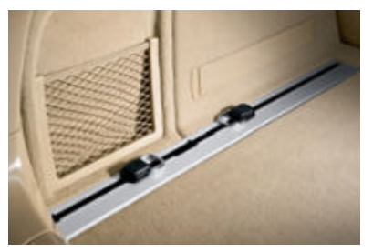
□ Storage package includes lighting in the centre console storage compartment, a 12-volt socket, two lashing rails with four lashing points in the luggage compartment, multi-function hooks, and storage nets left and right (included in the Activity Package).