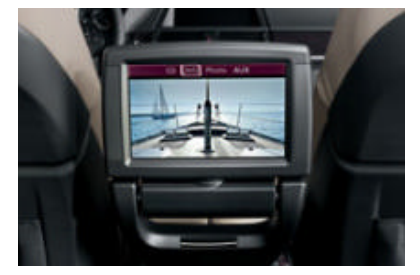
□ Rear DVD Entertainment System offers an independently controllable DVD player with a fold-down 8-inch screen. The system can be operated by wireless remote control, and features sockets for two headphones, an interface for an infrared headset, and an additional AUX/IN connection for external video sources (e.g., video camera).