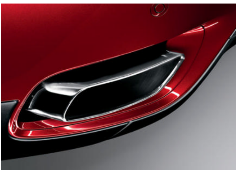
■ Tailpipes: the exhaust system of the BMW X6 xDrive50i features two rectangular tailpipes made of high-quality stainless steel. The tips are bordered with a chrome surround.