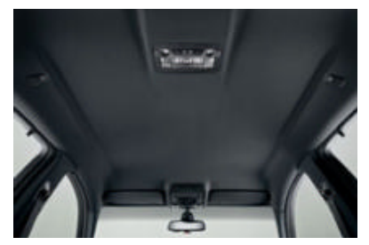
□ Anthracite roofliner: the A-, B-, C- and D-pillar trim, as well as the sun visors and roof grab handles, are finished in refined Black (included in Sport Packages).