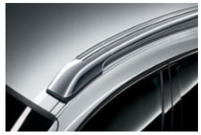
□ Roof railing, silver: available to lend the exterior of the new BMWX6 an individual touch.