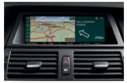
□ Navigation System with 8.8-inch colour display: traffic guidance provided by voice information, arrows and street maps. The split-screen function allows you to view radio and navigation data simultaneously.