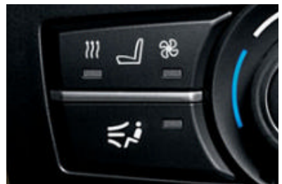
□ Active seat ventilation provides a noticeably more comfortable ride. Fans in the seat base and backrest blow air through the seat covers (available for the driver and passenger in conjunction with Nevada Leather, perforated, and Comfort Seats).