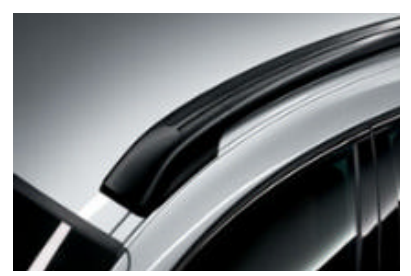
□ Roof railing, matte black: matched harmoniously to the car's design, the roof railing provides the foundation for BMW's multi-functional roof support for effortless and safe transportation of luggage, bicycles, skis, etc.