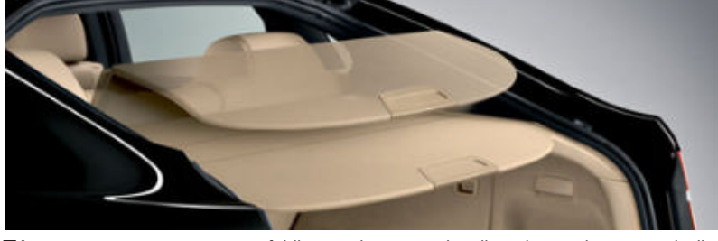
Luggage compartment cover, folding, can be removed easily and stowed away practically under the luggage compartment floor.

■ Split-folding rear seats can be asymmetrically split 60:40 and individually folded down.