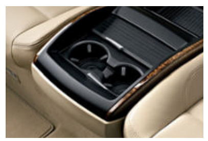
Cupholders integrated in the rear centre armrest.