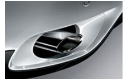
■ Tailpipes: The BMW X6 xDrive35i features two circular stainless steel tailpipes with a chrome surround.

■ Front ornamental kidney grille with titanium-coloured slats and chrome surround on the BMW X6 xDrive50i. The BMW X6 xDrive35i features black slats and chrome surround.