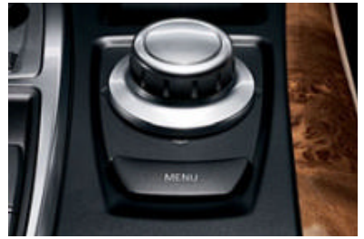
■ Controller is the central iDrive input element (for driver and passenger). Additional functions can be activated from the control display using this rotary/push button. Menu navigation is oriented to the four cardinal points. Different menus are available: Climate, Communication, Navigation, Entertainment, and on-board information.