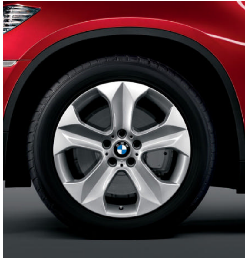
■ Star Spoke light alloy wheels – Style 232, 19 x 9.0, 255/50R-19, run-flat all-season tires (standard on the BMW X6 xDrive35i).