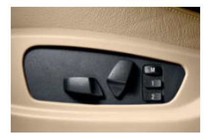
■ Seat adjustment, electric, for driver and front passenger, with memory function for driver's seat, steering column, and exterior mirrors.