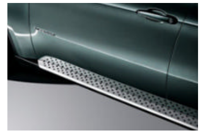
□ Aluminum running boards with rubber inserts give the new BMW X6 a particularly individual touch (105 mm wide).