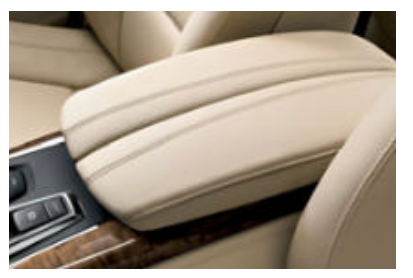
Front armrest, located on the centre console, can be positioned separately for driver, and passenger, and features a storage compartment.