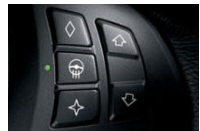
■ Steering wheel heating: just press a button to quickly warm up the steering wheel – a particularly pleasant amenity in winter.