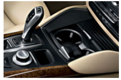
Cupholders (two) in the centre console at the front.