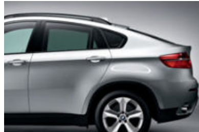
Privacy Glass for the rear side windows (behind the B-pillar) and rear window. These tinted windows reduce sun glare and ensure a pleasant temperature inside the car, even in hot weather.

Dever-folding exterior mirrors, with auto-dimming function (standard on the BMW X6 xDrive50i).