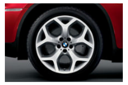
□ Y Spoke light alloy wheels - Style 214, 20 x 10.0 front, 275/40R-20, 20 x 11.0 rear, 315/35R-20, mixed run-flat performance tires (optional with the BMW X6 xDrive35i Sport Package).