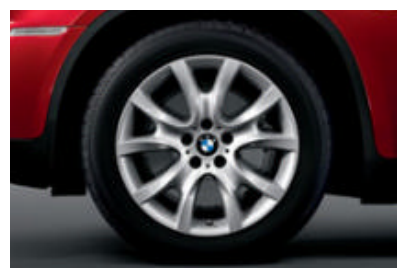
■ V Spoke light alloy wheels - Style 257, 19 x 9.0, 255/50R-19, run-flat all-season tires (standard on the BMW X6 xDrive50i).