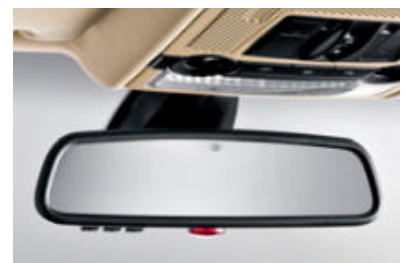
■ Interior mirror, with auto-dimming function, activates once a certain light intensity from following vehicles is reached (optional on the BMW X6 xDrive35i).

■ Alarm system with remote control: in any attempt to break into and manipulate your car, the alarm system sets off a loud signal and immediately switches on the hazard warning flashers.