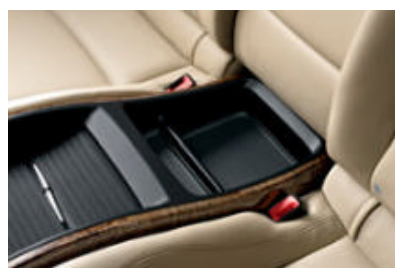
Storage options for a wide range of items are available in the centre console, in the front and rear doors and in the glovebox. AUX-IN connection for an external audio source, such as an MP3 player, is housed in the centre console.