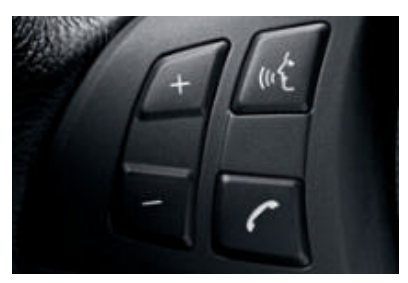
□ Voice recognition system, for adjusting e.g., navigation routes while driving. Functions are shown on the Control Display at the same time (this feature is included in the optional Technology Package and is standard on the BMW X6 xDrive50i).

□ Active Steering electronically varies the steering ratio on the basis of vehicle speed; more direct at low to medium speeds, more stable at high speeds. Includes Servotronic power assist.