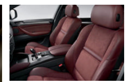
■ Sport seats for driver and passenger; highly contoured seat sides for optimal lateral support at all times. Seat height, seat angle, and backrest angle are electrically adjustable; thigh support is manually adjustable.