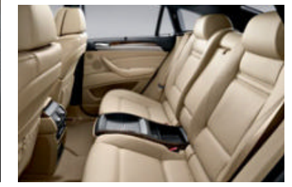
Two rear seats with sporty, individual character and integral head restraints. The seats also come with the fold-out centre armrest and two cupholders in the rear centre console.