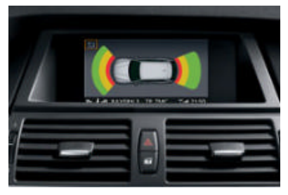
■ Park Distance Control (PDC), front and rear, makes parking easier in the narrowest spaces. The distance between the vehicle and the nearest obstacle is signalled acoustically, as well as visually in the Control Display.