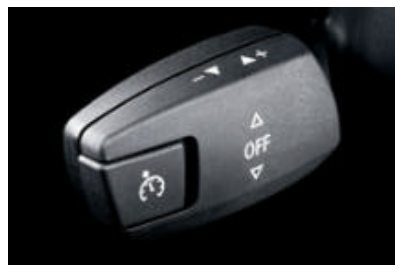
Cruise control with braking function facilitates comfortable driving at a pre-selected speed.