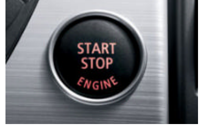
Start/Stop button for starting the engine. After inserting the ignition key you can start or stop the engine by pressing the button.