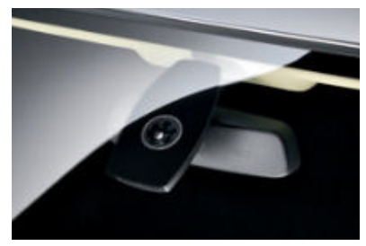
■ Rain sensor including automatic headlight control: once activated, the rain sensor automatically switches on the windshield wipers and controls wipe frequency, depending on how hard it is raining. This feature includes automatic headlight control, switching on the low-beam headlights automatically, for example, when it gets dark or when entering a tunnel.