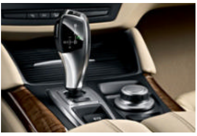
■ Six-speed Sport automatic transmission with Steptronic<sup>®</sup>. Gears are shifted very quickly and smoothly for optimum performance on the road.