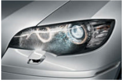
□ High-Pressure Headlight Cleaning System provides optimal illumination of the road ahead in all weather conditions. Headlights are automatically cleaned in parallel with the windshield when the lights are on.