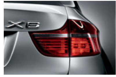
Adaptive Brakelights, two-stage, make it easier for drivers following from behind to see how hard you are applying the brakes. If you are applying the brakes in an emergency, the brakelights cover a larger area, allowing following traffic to distinguish between full application of the brakes and just a slight "tap" on the brakes. The result, clearly, is an even higher standard of driving safety on the road.