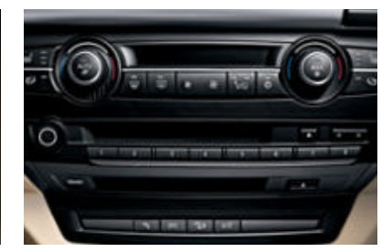
■ HiFi System with digital amplifier (205 watt) and 12 loudspeakers, as well as digital equalizing which adapts the sound optimally to the shape of the vehicle interior. □ USB/audio interface in the storage compartment under the front armrest for connecting a USB stick or external audio sources such as an iPod.