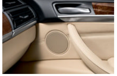
□ HiFi System Professional with a 600 watt digital amplifier and 16 loudspeakers guarantees a high-intensity audio experience at every seat.