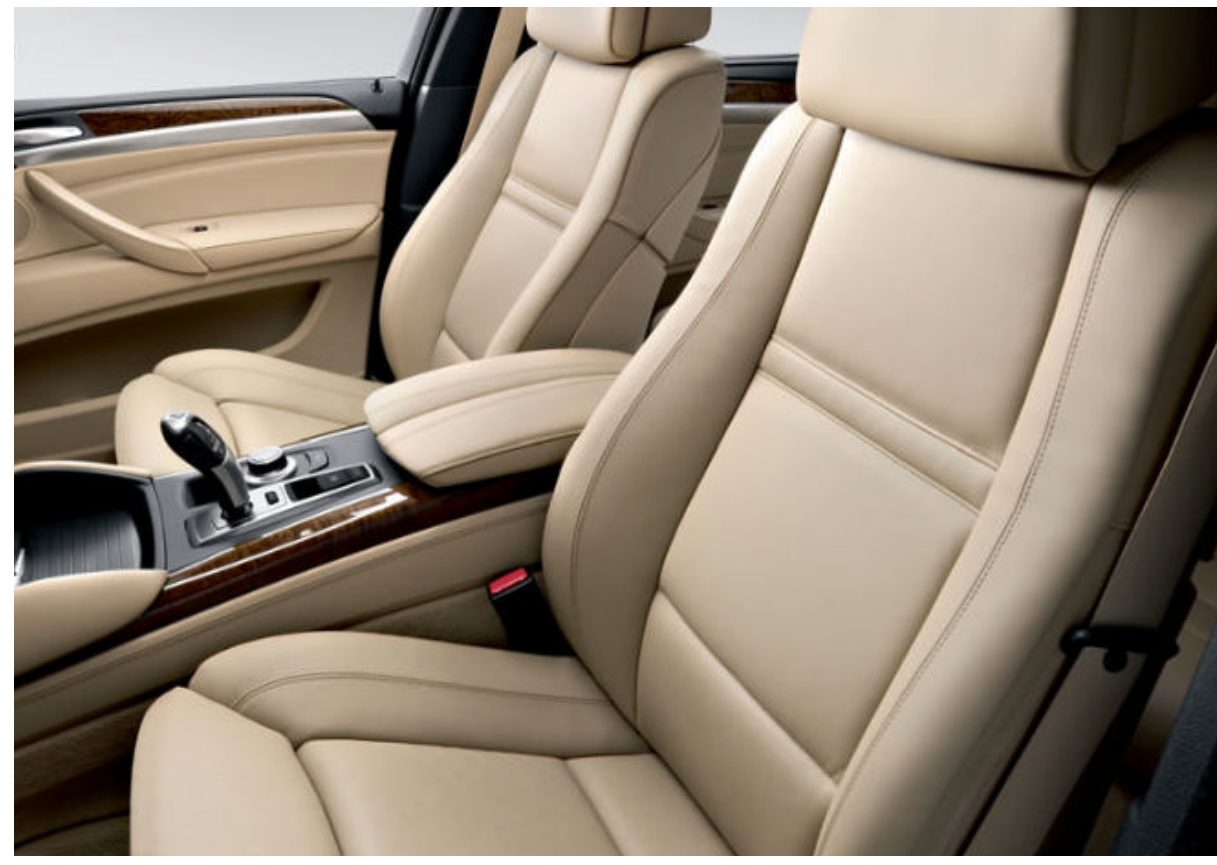
□ Comfort Seats for driver and front passenger, with electrical seat adjustment for all seat levels. In addition to the standard electric seat functions, Comfort Seats also provide electrically adjustable shoulder and thigh supports and backrest with lumbar support, plus two-way manual lateral adjustment for the front headrests and passenger-side memory settings.