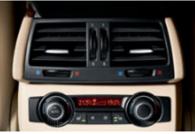
□ Automatic Climate Control, 4-zone, provides all the functionality of the 2-zone Climate Control system to passengers seated in the 2nd row. Two dials and a display at the back of the centre console allow for easy control. Additional air outlets and footspace heaters are also included.