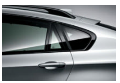
□ High-gloss Shadow Line covers window cavity cover and window frames.