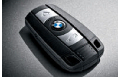
□ Comfort access for opening and locking the vehicle without holding the remote control. The engine can also be started without the key using the Start/Stop button.

■ Central locking for the doors and fuel cap, including electronic immobilizer and remote control with automatically recharging key battery.