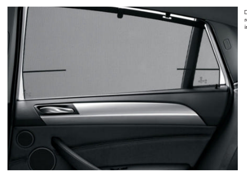
Sunblinds: manual sunblinds on each rear side window for reliable protection from intense sunglare.