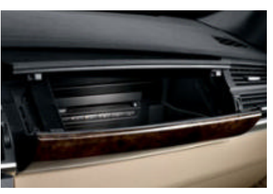
□ 6-disc multi-media changer, single slot, with features including scan function, random play, and MP3 and DVD audio capability; installed in the glove compartment.