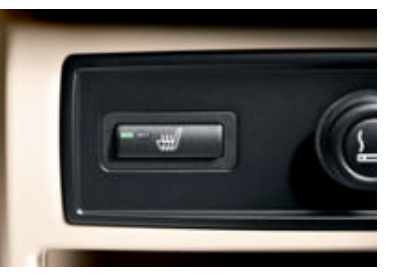
□ Seat heating at the rear, with two stages.