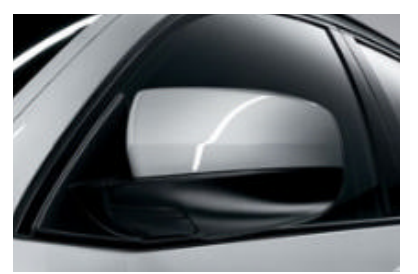
Exterior mirrors, electrically adjustable and heated, finished in body colour (mirror foot in black), in aspheric design and blue-tinted.

Dever-folding exterior mirrors, with auto-dimming function (standard on the BMW X6 xDrive50i).