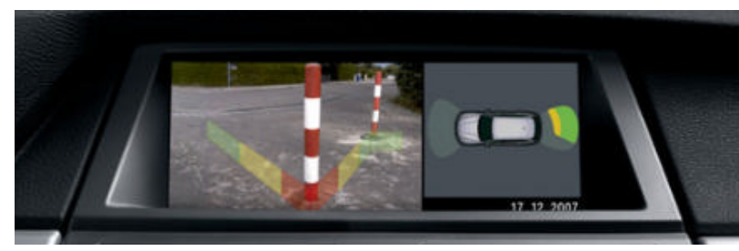
□ Rear-view Camera clearly shows the area behind the vehicle on the Control Display, where interactive road line markings show, for example, whether the target parking space is large enough for the vehicle. The Rear-view Camera is activated automatically when the reverse gear is selected.