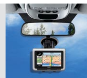
Clarion N.I.C.E 430 GPS