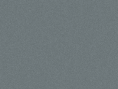
Sterling Grey Metallic | NH-741M