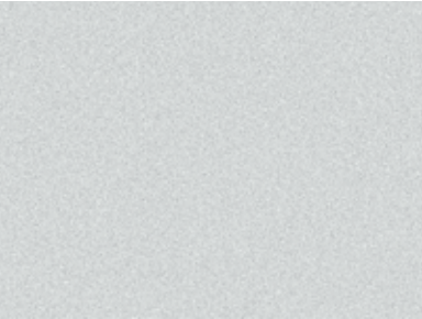
Billet Silver Metallic | NH-689M