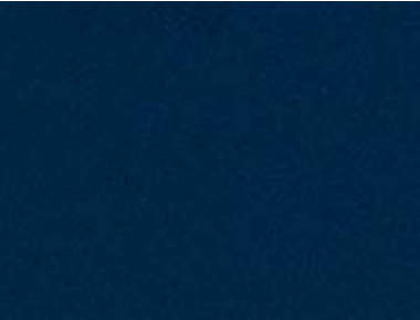
Bali Blue Pearl | B-552P