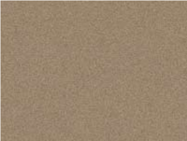
Mocha Metallic | YR-573M