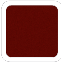
Royal Red Metallic

Ford uses clearcoat paint for beauty and protection. Colours shown are representative only. Not all colours are available on all models. See your Ford of Canada Dealer for actual paint/trim options.