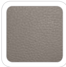
Stone Leather Optional on XLT