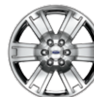
20-in. Chrome-Clad Aluminum Optional on Eddie Bauer, Eddie Bauer MAX, Limited and Limited MAX