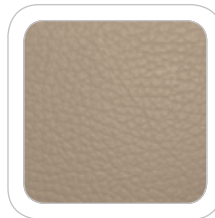
Camel Leather Optional on XLT; Standard on Eddie Bauer