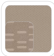
Camel Cloth Standard on XLT