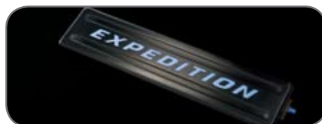
Front illuminated sill plates

Garmin is a registered trademark of Garmin Ltd.