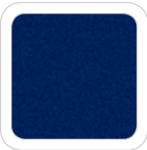
Dark Blue Pearl Metallic