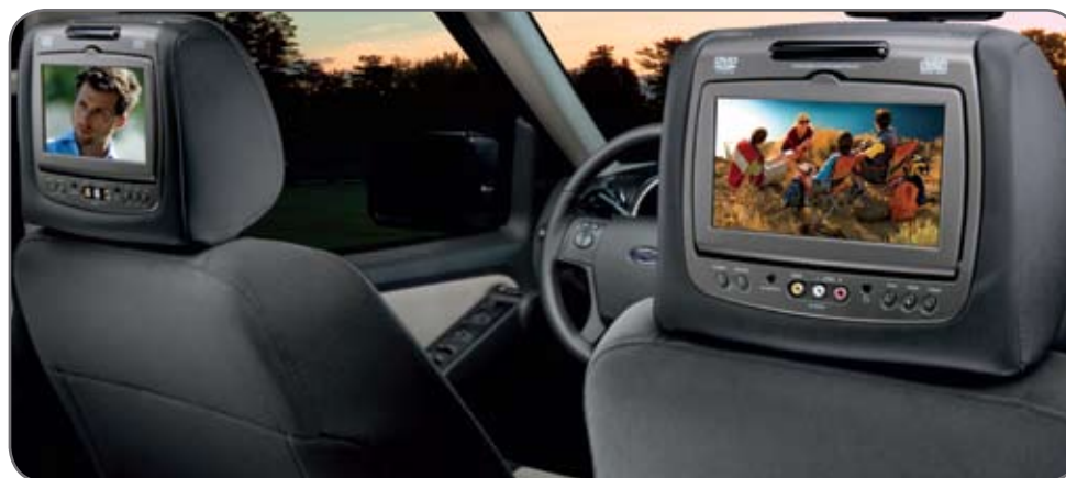
Dual INVISION DVD Headrests¹