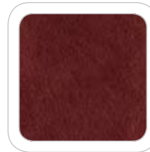
Chaparral Leather 2 Standard on King Ranch ®