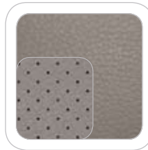
Stone Leather with Perforated Inserts Standard on Limited