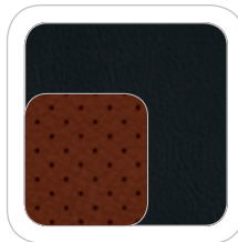
Charcoal Black Leather with Caramel Perforated Inserts Standard on Limited