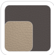
Greystone Leather 1 with Camel Inserts Standard on Eddie Bauer