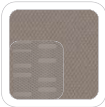
Stone Cloth Standard on XLT