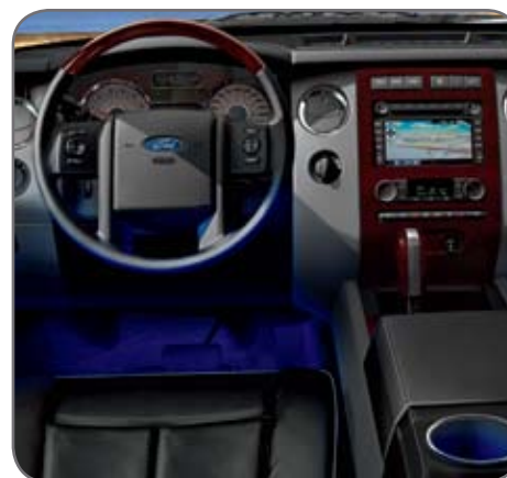
Interior lighting kit