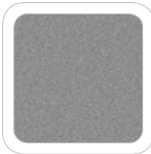
Vapour Silver Metallic