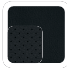
Charcoal Black Leather with Perforated Inserts Standard on Limited