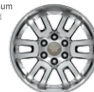
18-in. Machined-Aluminum with King Ranch® Centre Cap Standard on King Ranch and King Ranch MAX