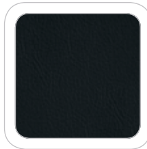
Charcoal Black Leather Optional on XLT