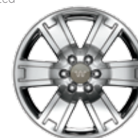
20-in. Chrome-Clad Aluminum with King Ranch Centre Cap Optional on King Ranch and King Ranch MAX