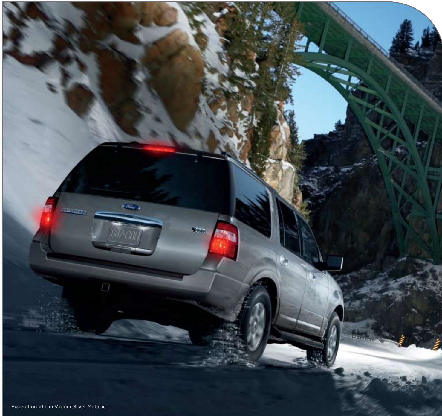
Expedition XLT in Vapour Silver Metallic.

What you don't see about Expedition are some of its most important features. AdvanceTrac® with RSC® (Roll Stability Control™) is standard on all models. The system features a unique vehicle-roll motion sensor that works in conjunction with the Anti-lock Brake System (ABS) to help keep Expedition grounded. If the sensor detects loss of contact with the road, it applies brakes to individual wheels and modifies engine power to help keep all 4 tires on the ground!