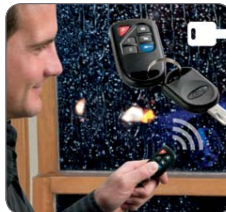
Remote start systems