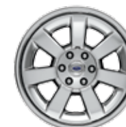
18-in. Chrome-Clad Aluminum Standard on Limited and Limited MAX; Optional on XLT