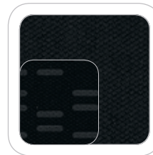
Charcoal Black Cloth Standard on XLT