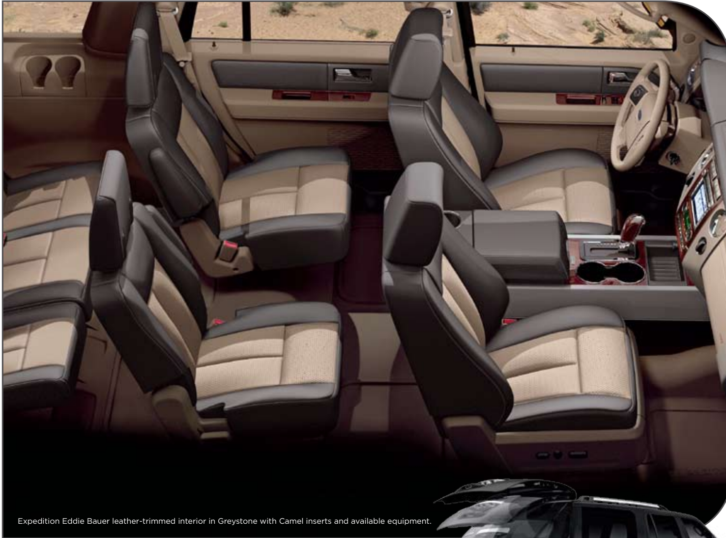
Expedition Eddie Bauer leather-trimmed interior in Greystone with Camel inserts and available equipment.

Expedition's great looks are only overshadowed by its comfortable and beautiful interior. Standard on Eddie Bauer, King Ranch® and Limited are heated and cooled 1st-row low-back bucket seats with a 10-way power driver seat and a 6-way power front-passenger seat (10-way passenger seat on Limited models). 2nd-row heated seats are standard on King Ranch and Limited. The PowerFold™ 3rd-row seat is standard on Eddie Bauer, King Ranch and Limited models. Also standard on Eddie Bauer, King Ranch and Limited are memory features for the driver seat, sideview mirrors and power-adjustable pedals with 2 settings.