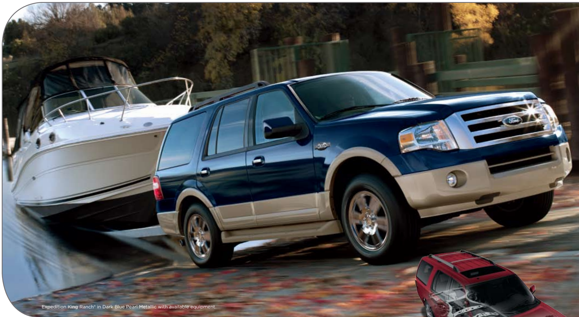
Expedition King Ranch® in Dark Blue Pearl Metallic with available equipment.

Just looking at Expedition and Expedition MAX makes you want to pack them full of gear, hook up your favourite toy and go. You'll figure out where later. Great styling, a bold stance, room for 8, and a Heavy-Duty Trailer Tow Package make Expedition the perfect road trip partner. New for 2009 are available rain-sensing wipers and the industry-first Easy Fuel™ capless fuel-filler system that helps you spend less time at the pump.