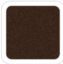
Stone Green Metallic