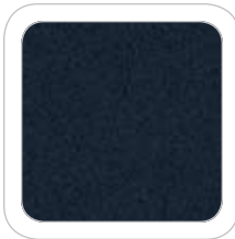
Black Pearl Slate Metallic