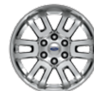
18-in. Machined-Aluminum Standard on Eddie Bauer and Eddie Bauer MAX