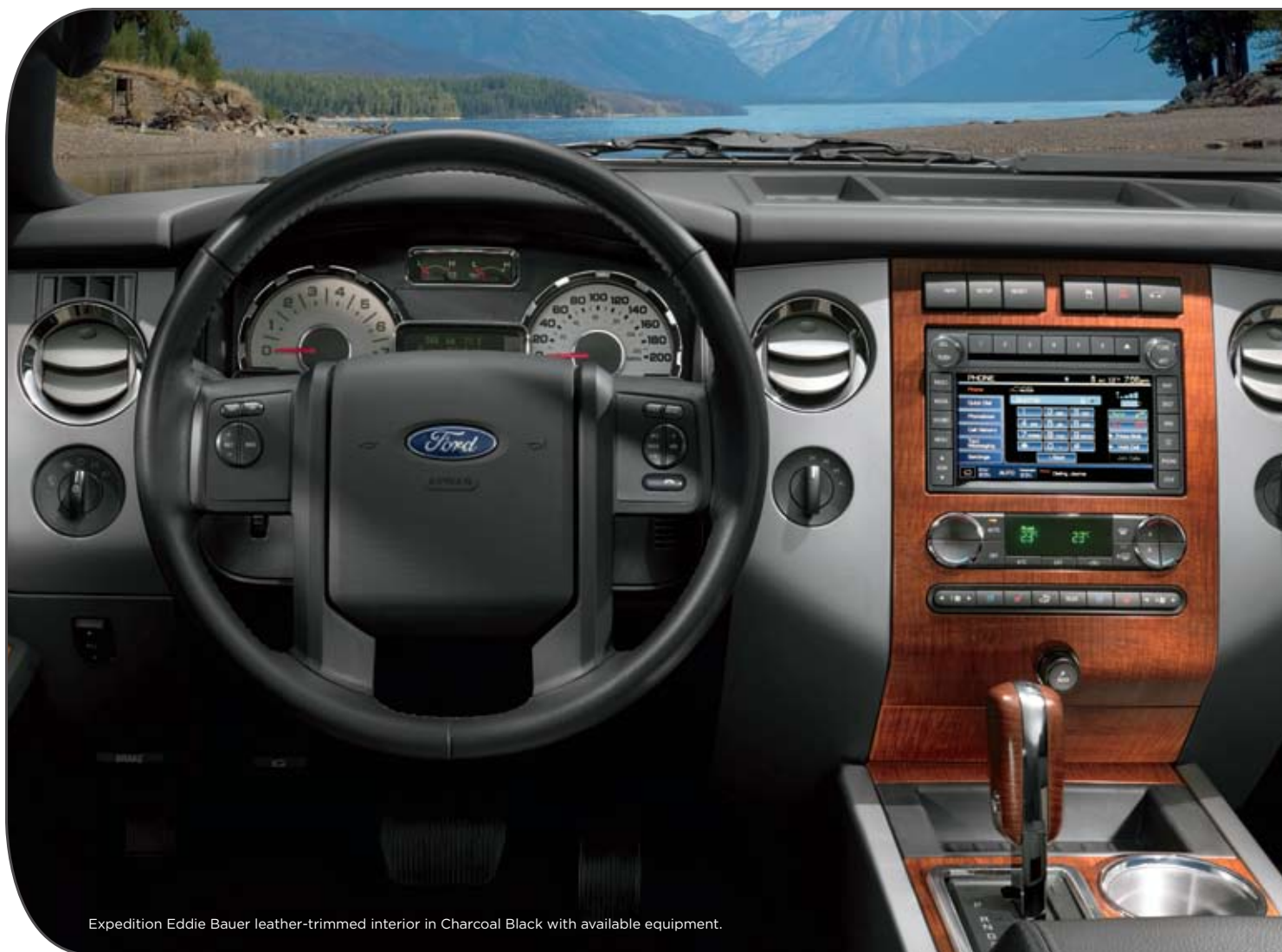
Expedition Eddie Bauer leather-trimmed interior in Charcoal Black with available equipment.

An available Rear View Camera displays images from a liftgate-mounted camera onto your rearview mirror when the system is activated. If equipped with the optional voice-activated Navigation System, images are displayed on the 6.5-in. colour screen.