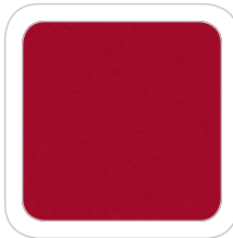
Sangria Red Metallic