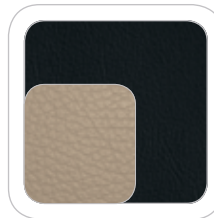
Charcoal Black Leather with Camel Inserts Standard on Eddie Bauer