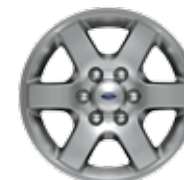
17-in. Aluminum Standard on XLT