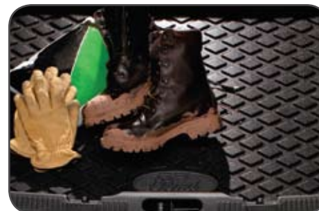
Interior cargo area protector