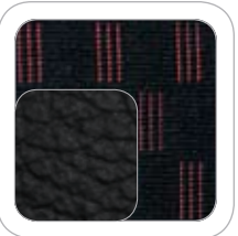
Red Cloth/ Charcoal Black Vinyl