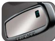
Electrochromic mirror with HomeLink®