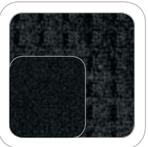
Charcoal Black Cloth