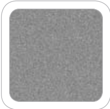
Vapour Silver Metallic