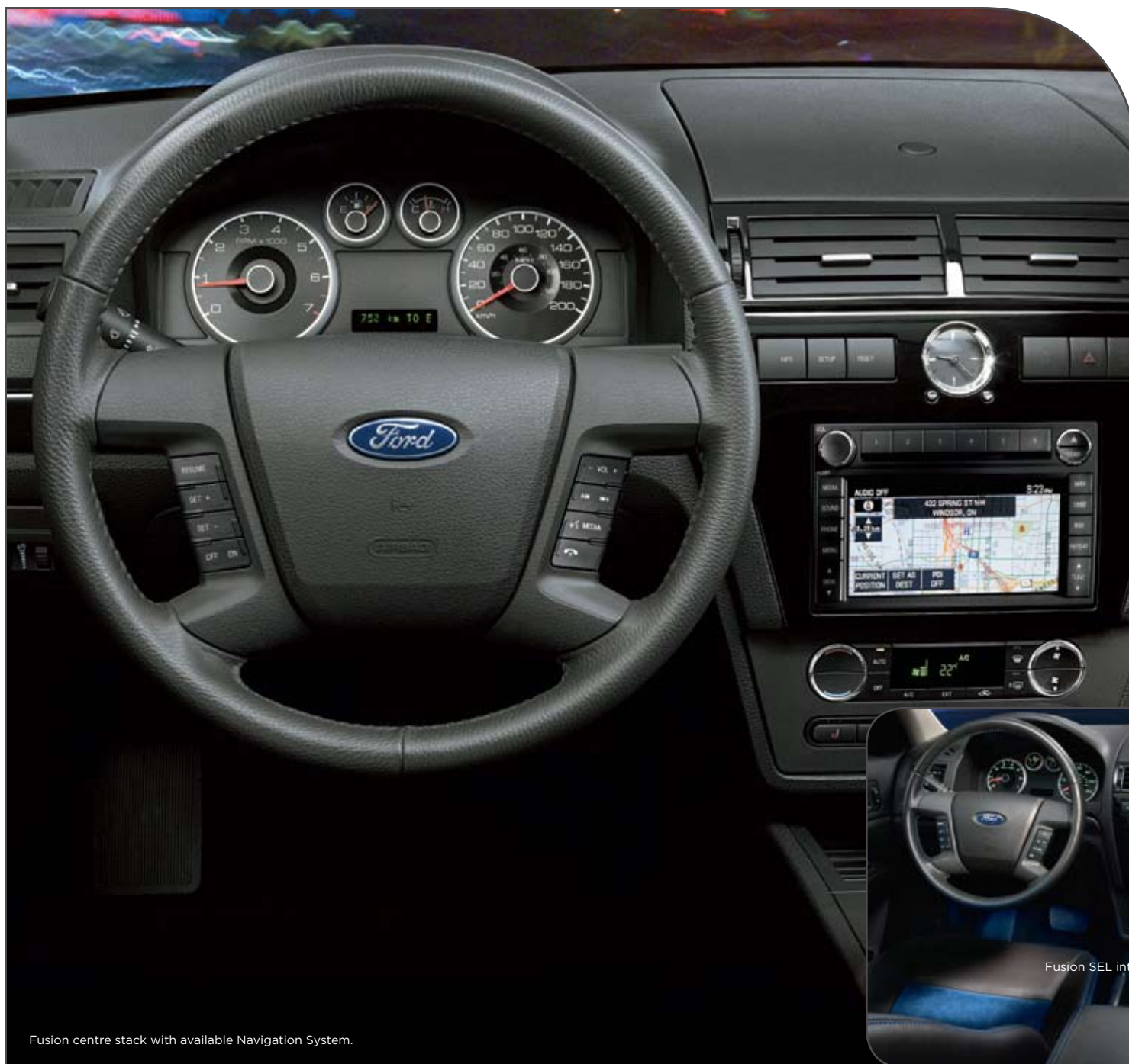
Fusion centre stack with available Navigation System.

1 See your Ford of Canada Dealer or contact SIRIUS at 1-888-539-7474 for more information.