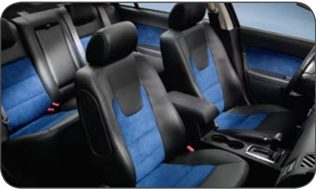
Blue Suede Package interior