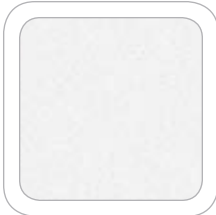
White Platinum Tri-Coat Metallic