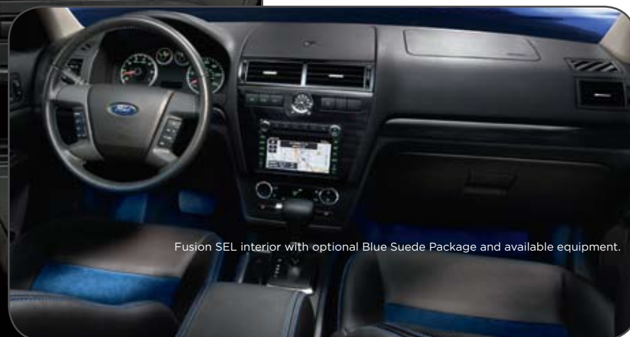
Fusion SEL interior with optional Blue Suede Package and available equipment.