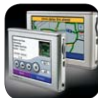
Garmin® nüvi® Portable Navigation System 1