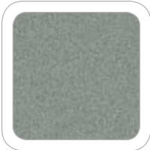
Moss Green Metallic