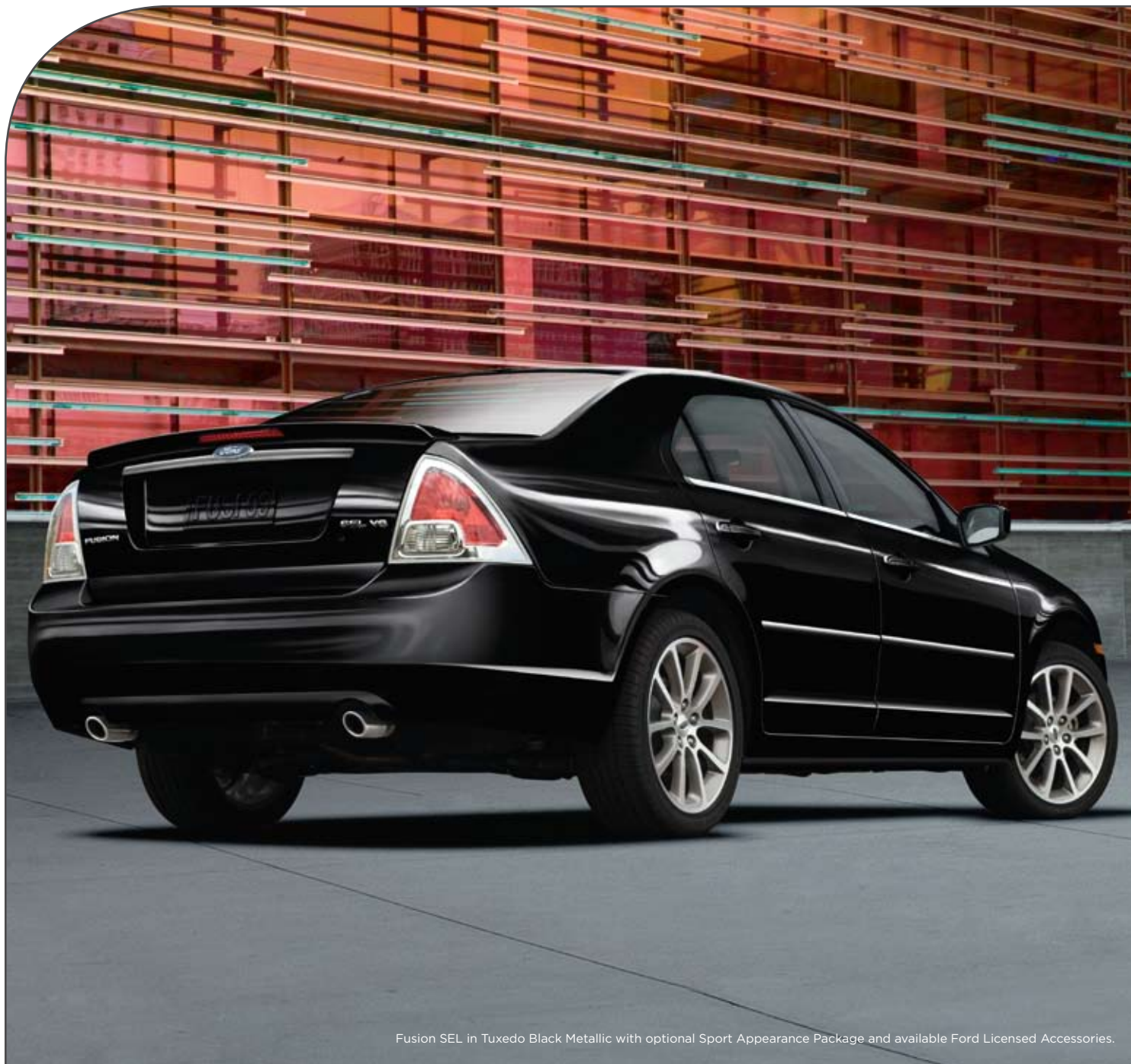
Fusion SEL in Tuxedo Black Metallic with optional Sport Appearance Package and available Ford Licensed Accessories.

Dress up your Fusion a little more with great-looking wheels. The 17-in. x 8-in. 5-spoke GT style is available in polished-aluminum or Painted Black and includes a centre cap with the Ford logo.