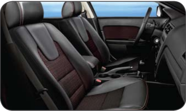
Sport Appearance Package interior with cloth seat inserts

¹Always wear your safety belt and secure children in the rear seat.