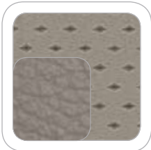
Medium Light Stone Leather