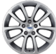
18-in. Painted-Aluminum Included with Blue Suede Package