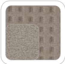
Medium Light Stone Cloth