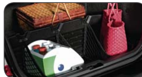
Interior cargo organizer