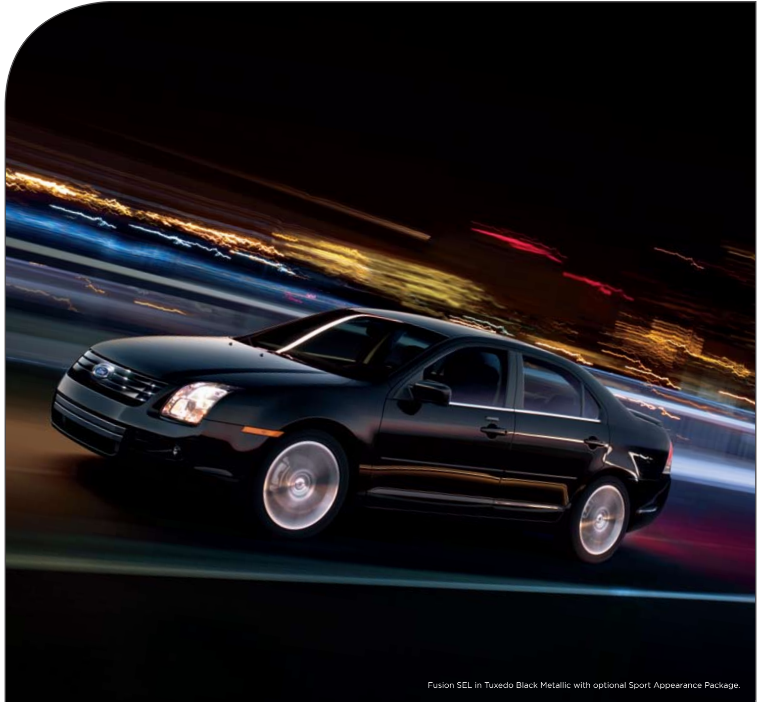
Fusion SEL in Tuxedo Black Metallic with optional Sport Appearance Package.

Fusion offers an optional Sport Appearance Package that features a brushed-aluminum stereo surround and Charcoal Black seats with red or grey cloth inserts. Contrasting stitching further enhances the seat appearance and accents the steering wheel and centre console. Exterior components include a black-chrome grille and 18-in. aluminum wheels with painted pockets.