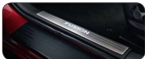
Front illuminated sill plates

Ford ESP PremiumCare Plan. Depending on the Ford ESP Plan you select, some Dealer-installed Genuine Ford Accessories can be covered up to 7 years or 150,000 km. See your Ford of Canada Dealer for details.