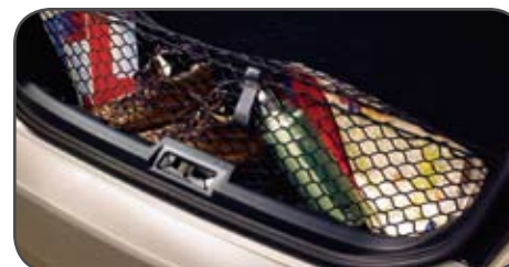
Interior cargo net