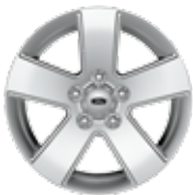
16-in. Painted-Aluminum Optional on SE I-4