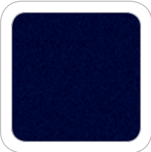
Dark Ink Blue Metallic