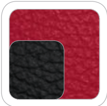
Red/Charcoal Black Leather