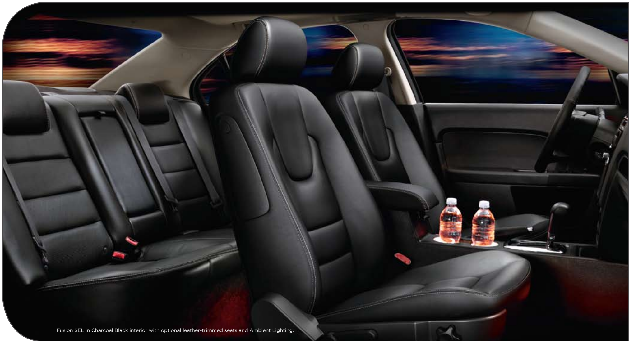
Fusion SEL in Charcoal Black interior with optional leather-trimmed seats and Ambient Lighting.