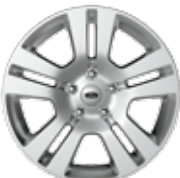
17-in. Machined-Aluminum Standard on SEL