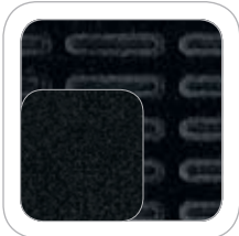
Charcoal Black Cloth