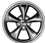
17-in. Polished-Aluminum Genuine Ford Accessory