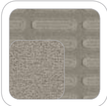
Medium Light Stone Cloth