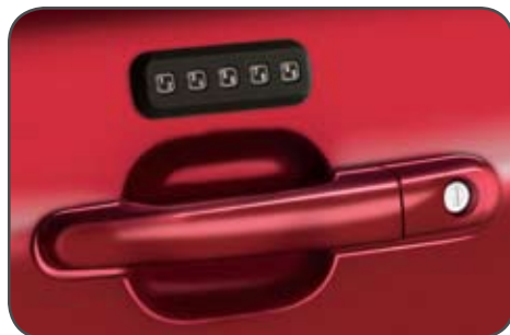
Keyless entry keypad

Garmin is a registered trademark of Garmin Ltd.