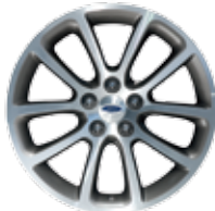
18-in. Aluminum with Painted Pockets Included with Sport Appearance Package