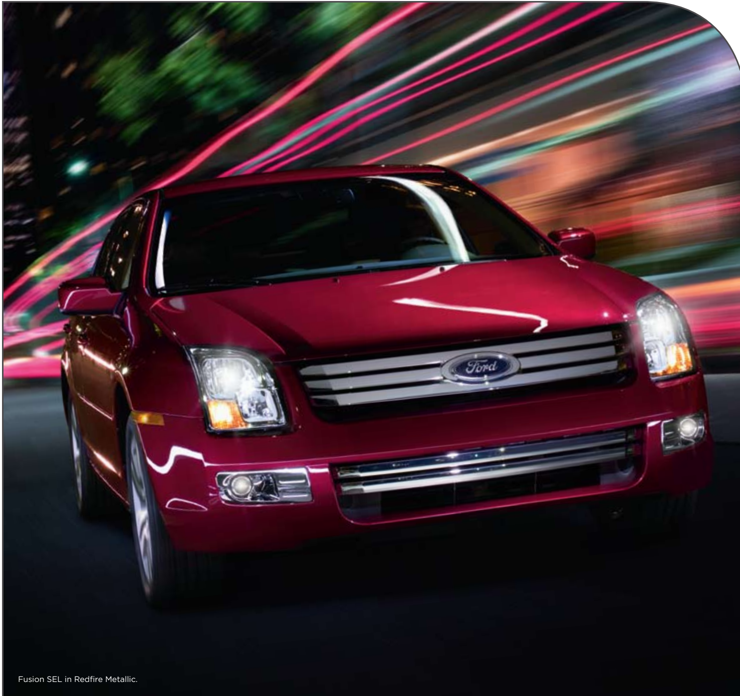
Fusion SEL in Redfire Metallic.