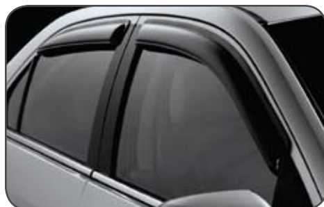
Side window deflectors