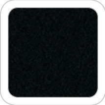
Tuxedo Black Metallic

Ford uses clearcoat paint for beauty and protection. Colours shown are representative only. Not all colours are available on all models. See your Ford of Canada Dealer for actual paint/trim options.