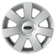
16-in. Steel with Deluxe Cover Standard on SE I-4