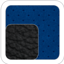
Blue Suede/ Charcoal Black Leather