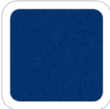
Sport Blue Metallic