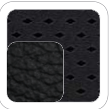
Charcoal Black Leather