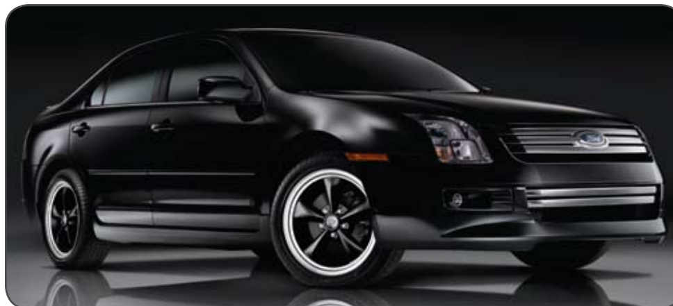
Body Kit (5-piece) 1