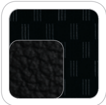
Grey Cloth/ Charcoal Black Vinyl