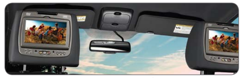
Dual INViSiON DVD Headrests<sup>1</sup>