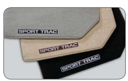
Premium carpeted floor mats

Ford ESP PremiumCare Plan. Depending on the Ford ESP Plan you select, some Dealer-installed Genuine Ford Accessories can be covered up to 7 years or 150,000 km. See your Ford of Canada Dealer for details.