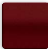
CABERNET RED PEARL Interior: Cashmere