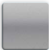
TITANIUM GREY METALLIC Interior: Black