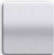
PLATINUM METALLIC Interior: Black

Our vivid palette of exterior colours is the perfect way to complete your Genesis. Explore the options and choose the one that best reflects your personal style.