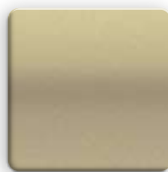
CHAMPAGNE BEIGE METALLIC Interior: Saddle Leather