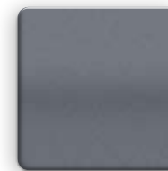
STERLING BLUE METALLIC Interior: Black