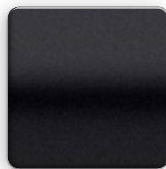
PHANTOM BLACK Interior: Black