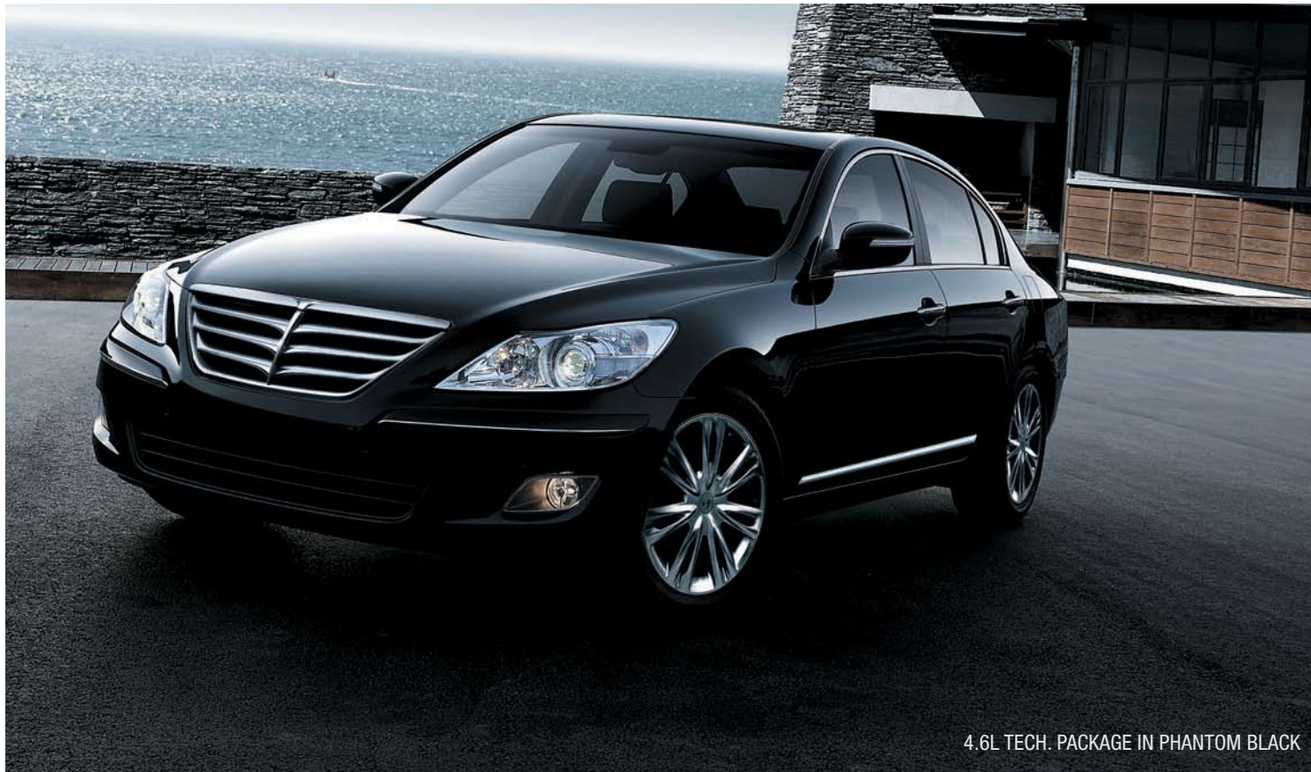
4.6L TECH. PACKAGE IN PHANTOM BLACK