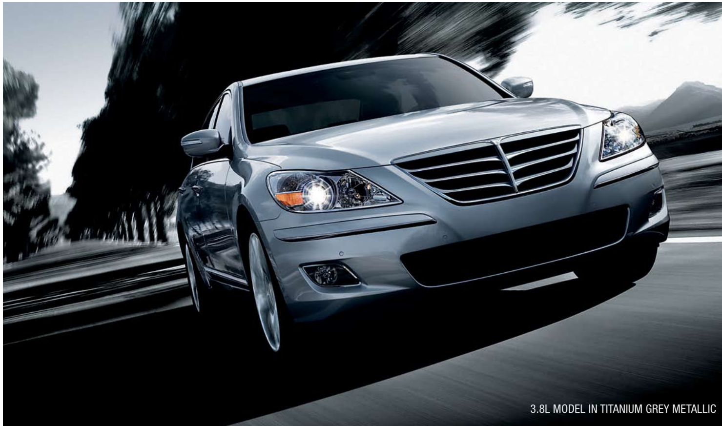
3.8L MODEL IN TITANIUM GREY METALLIC