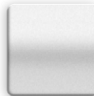
WHITE SATIN PEARL Interior: Black