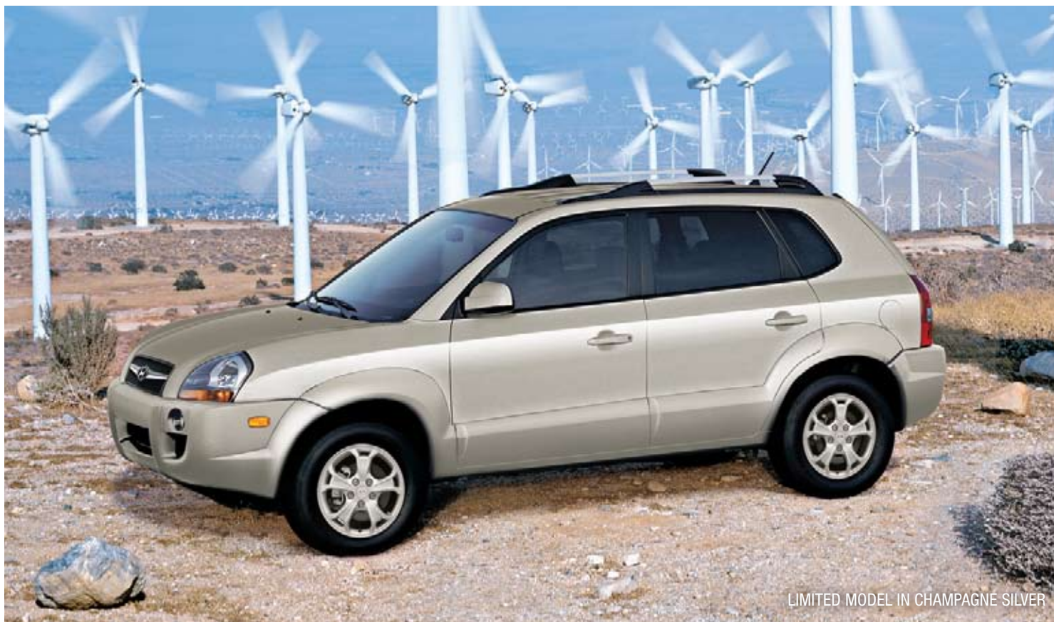
LIMITED MODEL IN CHAMPAGNE SILVER