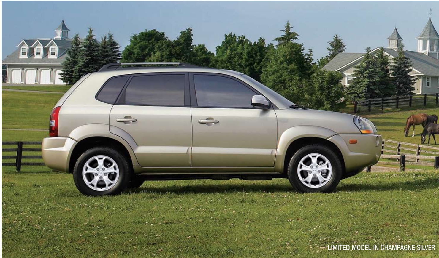
LIMITED MODEL IN CHAMPAGNE SILVER