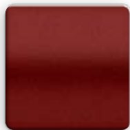
MESA RED Interior: Grey