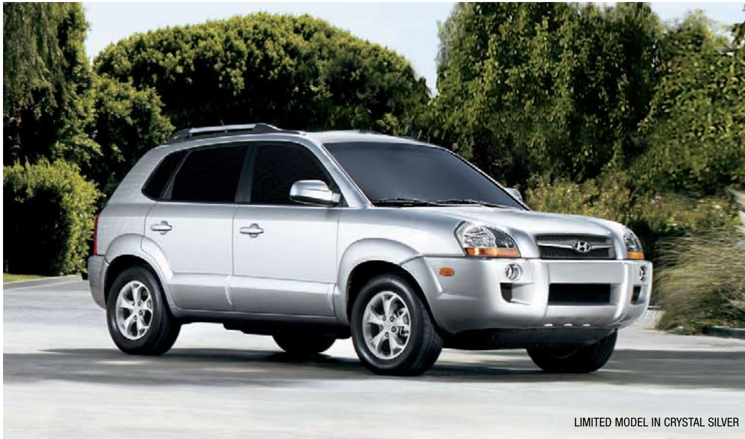
LIMITED MODEL IN CRYSTAL SILVER