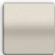
CHAMPAGNE SILVER Interior: Grey