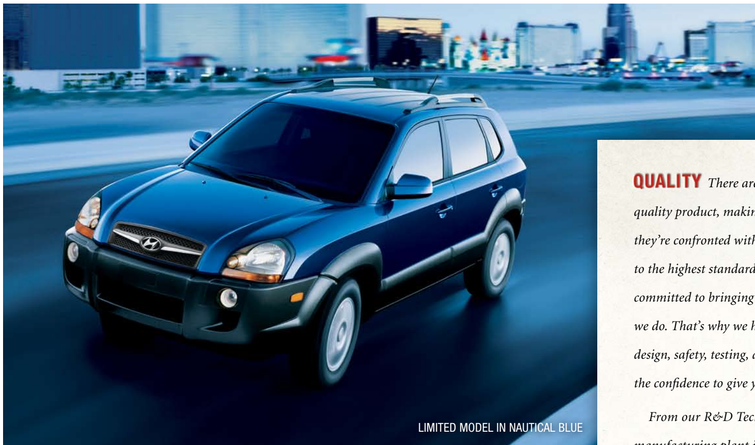
LIMITED MODEL IN NAUTICAL BLUE