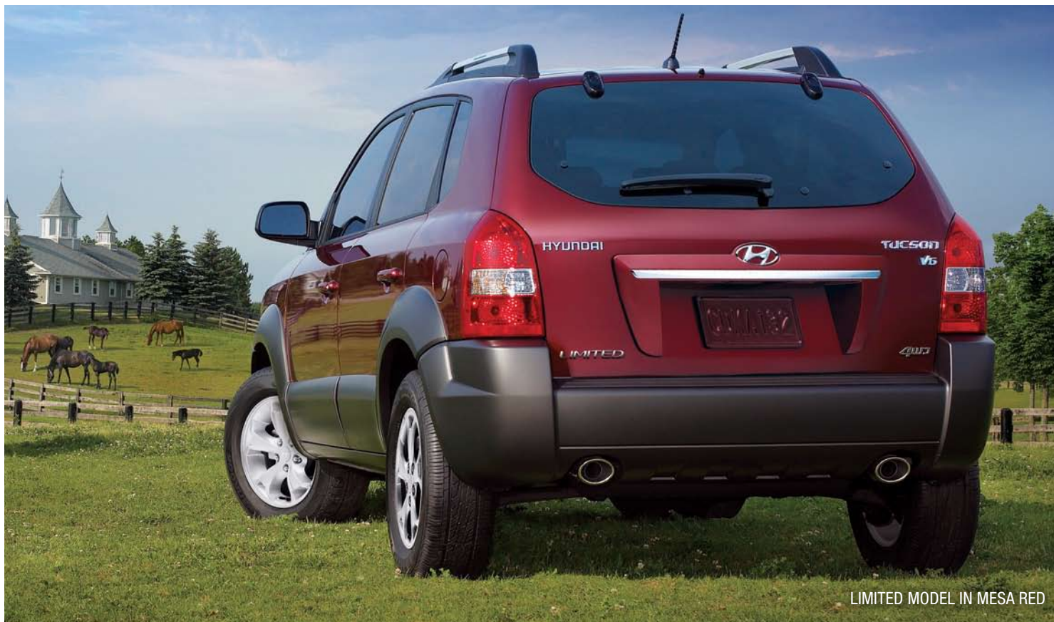
LIMITED MODEL IN MESA RED