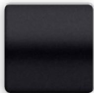
EBONY BLACK Interior: Black