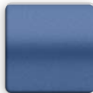
NAUTICAL BLUE Interior: Grey