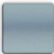
ARCTIC BLUE Interior: Black

Our vivid palette of exterior colours is the perfect way to complete your Tucson. Explore the options and choose the one that best reflects your personal style.