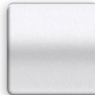
CRYSTAL SILVER Interior: Black