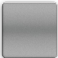
GRAPHITE GREY Interior: Black

Our vivid palette of exterior colours is the perfect way to complete your Tucson. Explore the options and choose the one that best reflects your personal style.