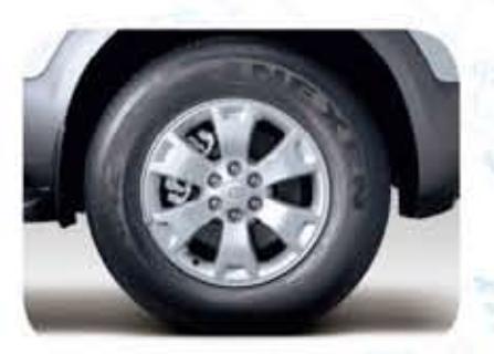
17" x 7.0" 6-spoke alloy wheels