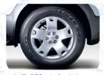
18" x 7.5" 5-spoke alloy wheels