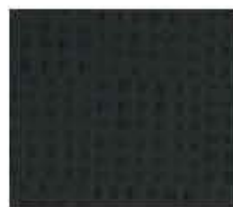
Black Cloth (BC)