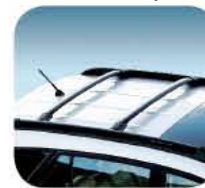
Roof rack crossbars