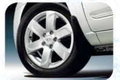
16" x 6.5" 6-spoke alloy wheels