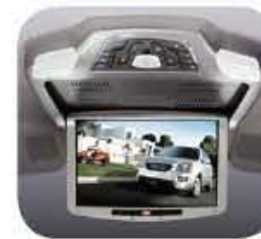
10" DVD entertainment system