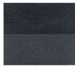
Black Leather (BL)