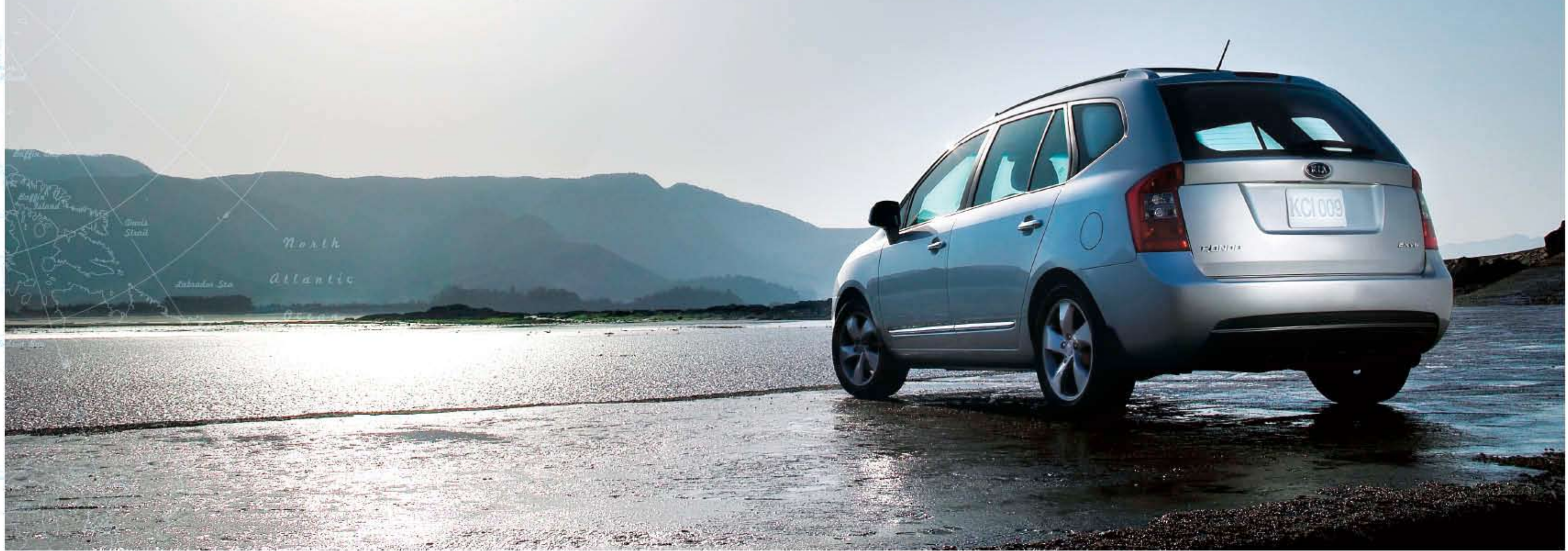
Rondo EX V6 shown in Bright Silver

The 2009 Rondo Wide open spaces also come standard.