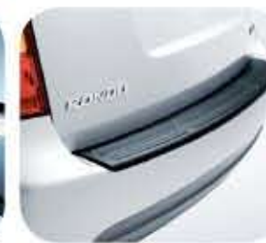
Rear bumper protector