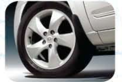
17" x 6.5" 5-spoke alloy wheels

* Some restrictions apply. For more information on our 5-5-5 Total Care Ownership Coverage, call us at 1-877-542-2886. ††NHTSA (National Highway Traffic Safety Administration) test results. Visit www.nhtsa.dot.gov/ncap for full details. All information contained herein was accurate and correct at the time of printing. Kia Canada Inc. reserves the right to make changes at any time without notice, and without any obligations as to colours, materials, specifications, features, accessories, packages, models and any applicable programs. Some vehicles shown may include optional equipment or may not be exactly as shown. Kia Canada Inc., by the publication and dissemination of this material, does not create any warranties, either expressed or implied, to any Kia products. See your Kia dealer or website for further details. SIRIUS logo and related marks are trademarks of SIRIUS Satellite Radio Inc. Reproduction of the contents of this material without the expressed written approval of Kia Canada Inc. is prohibited. © 2008 Kia Canada Inc. Printed in Canada, August 2008.