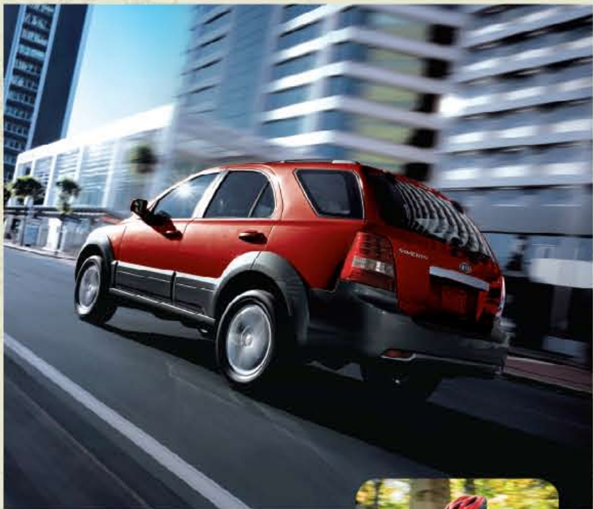
Sorento LX Luxury, shown in Spicy Red Metallic

The Sorento comes equipped with standard Bluetooth® technology* so you can keep your cell phone in your pocket while you make hands-free calls. No earpiece is required since you hear your phone over the audio system's speakers and speak into the built-in microphone.