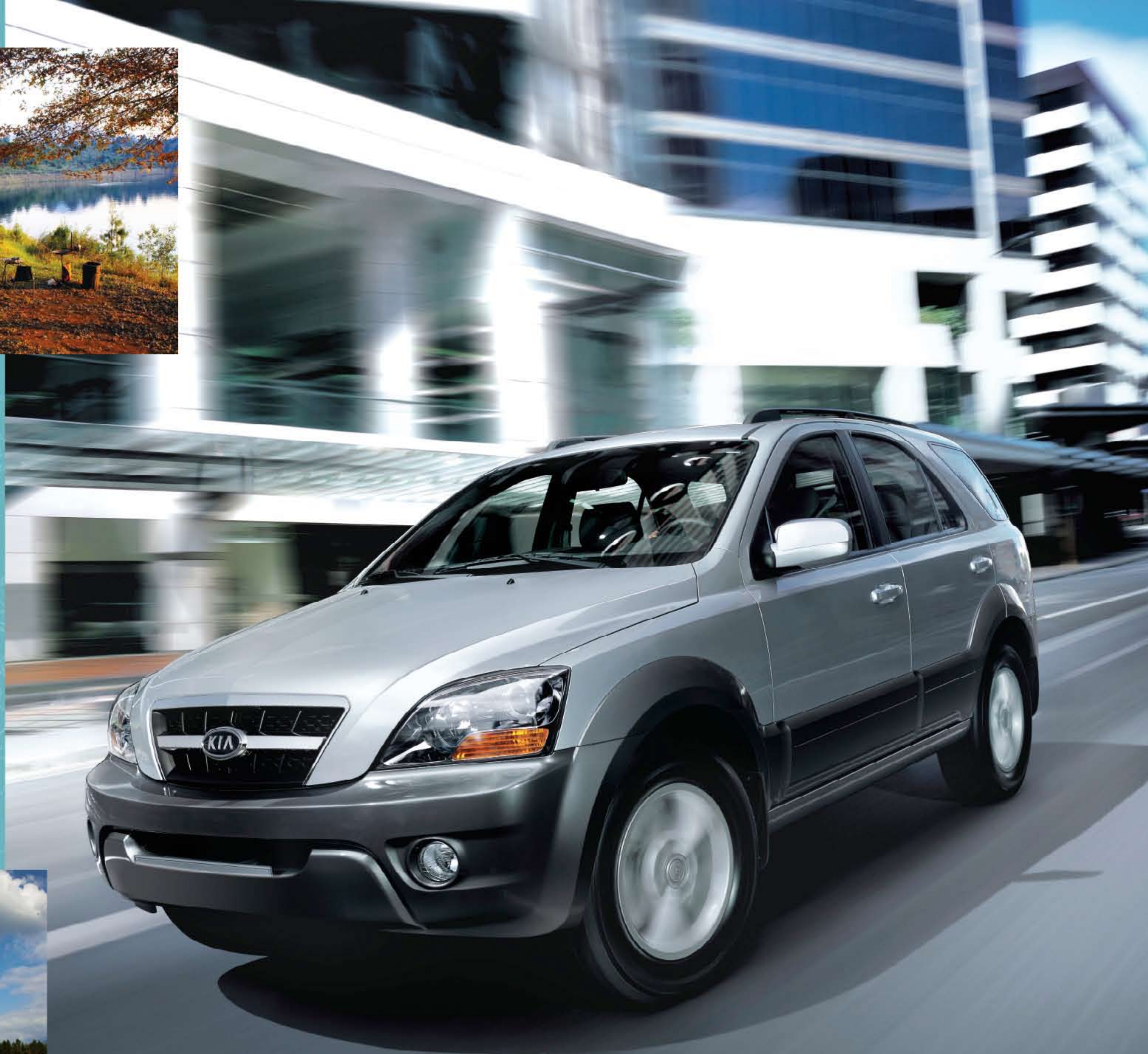
Sorento LX Luxury shown in Bright Silver Metallic