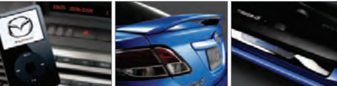
Pictured above from left to right: iPod® adapter 2 , Raised rear spoiler, Scuff plates with LED illumination.