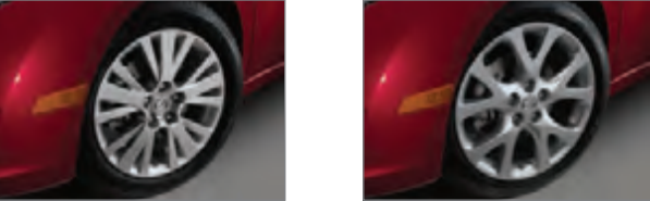
17" alloy wheels (GS) 18" alloy wheels (GT)

For further information, please refer to the MAZDA6 Accessories Brochure. Mazda notes that all Genuine Mazda Accessories, if installed by your Mazda Dealer prior to or at an initial vehicle retail delivery, carry the same new-vehicle basic warranty as the MAZDA6.