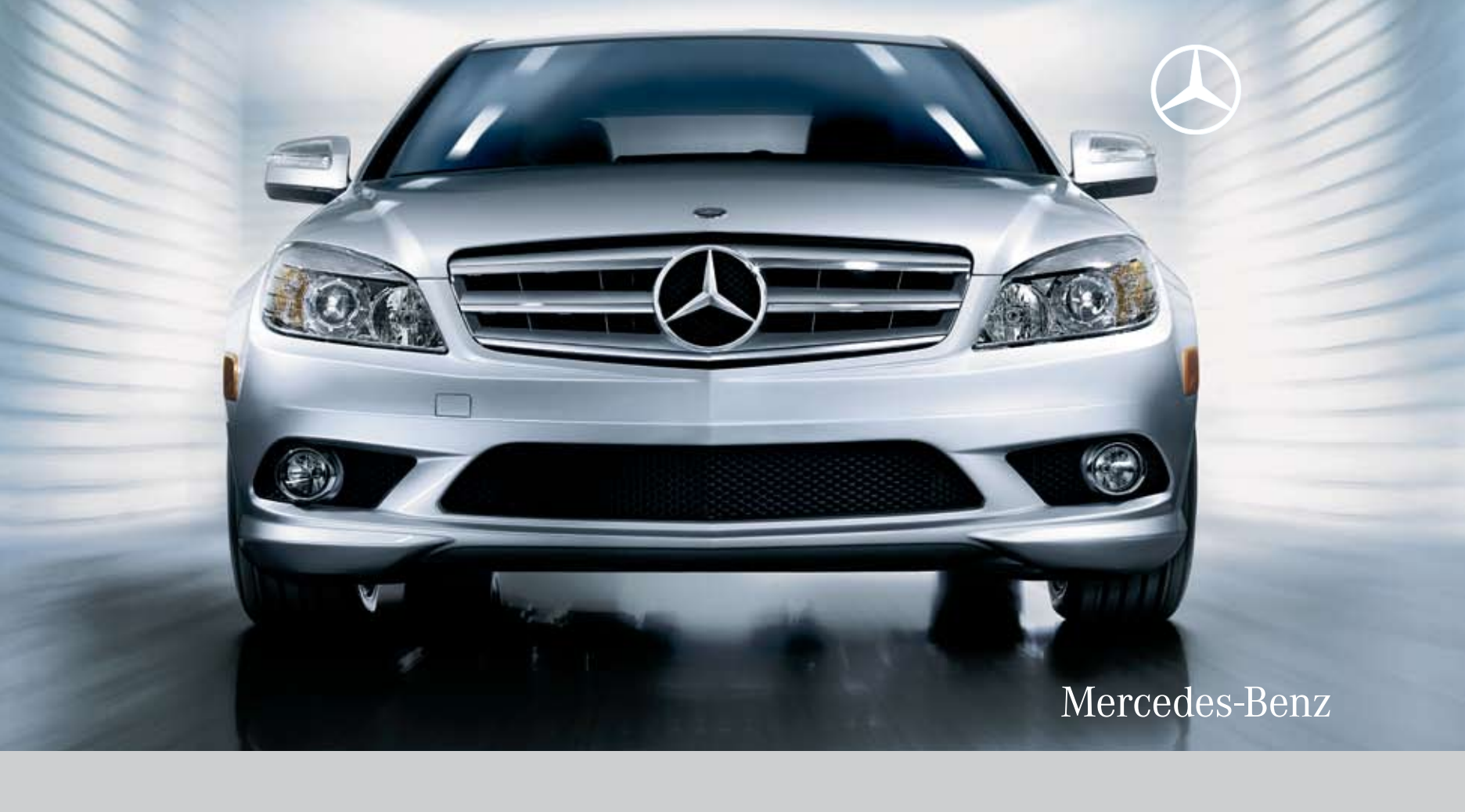
2009 Mercedes-Benz Fleet Operations