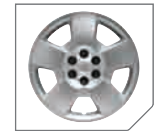
A – 17" steel with bolt-on wheel covers