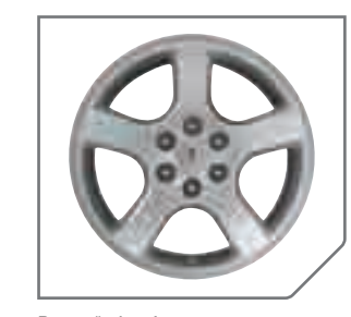
B – 17" aluminum