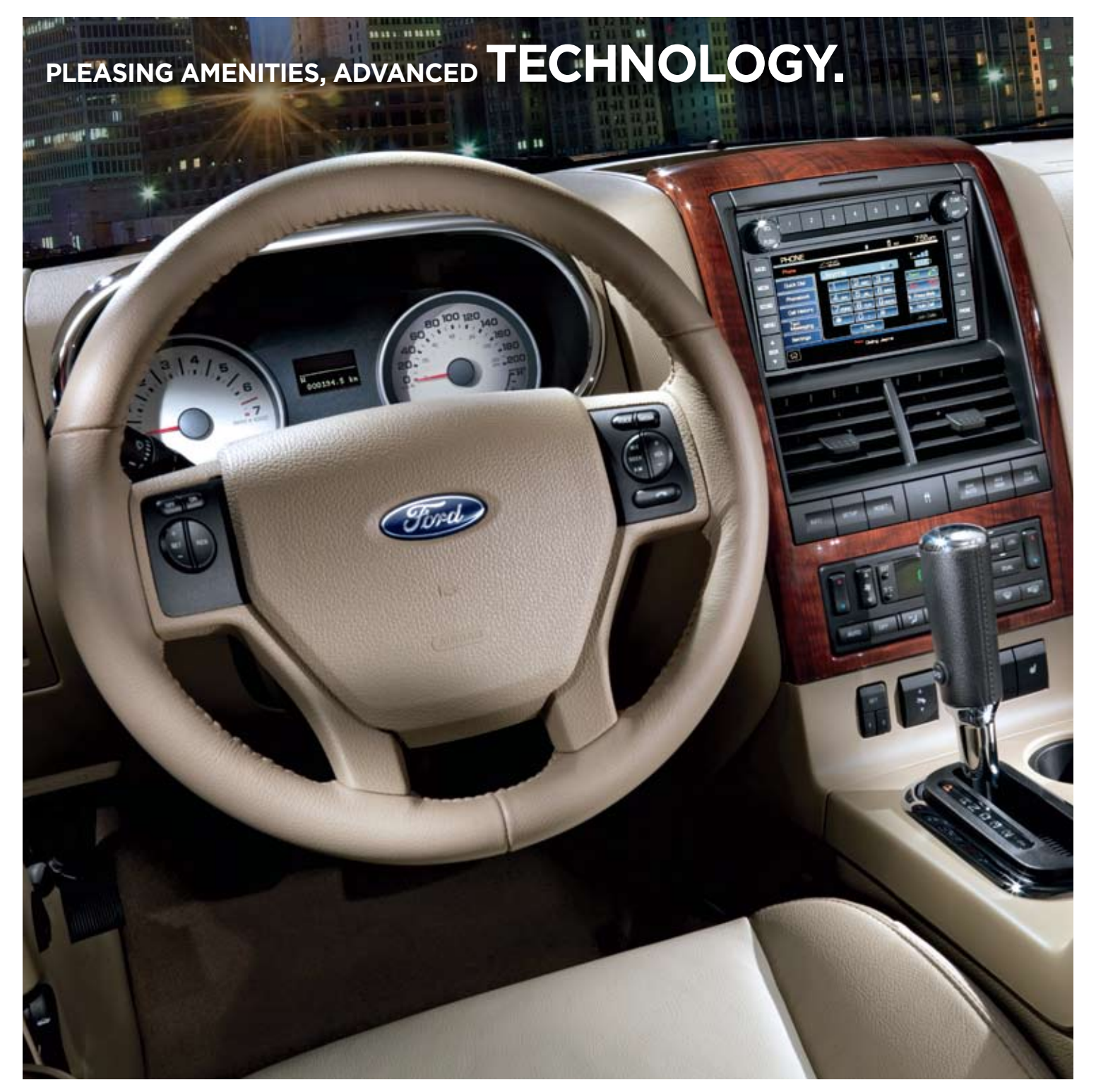
Explorer Eddie Bauer® leather-trimmed interior in Camel with Sand inserts and available equipment.