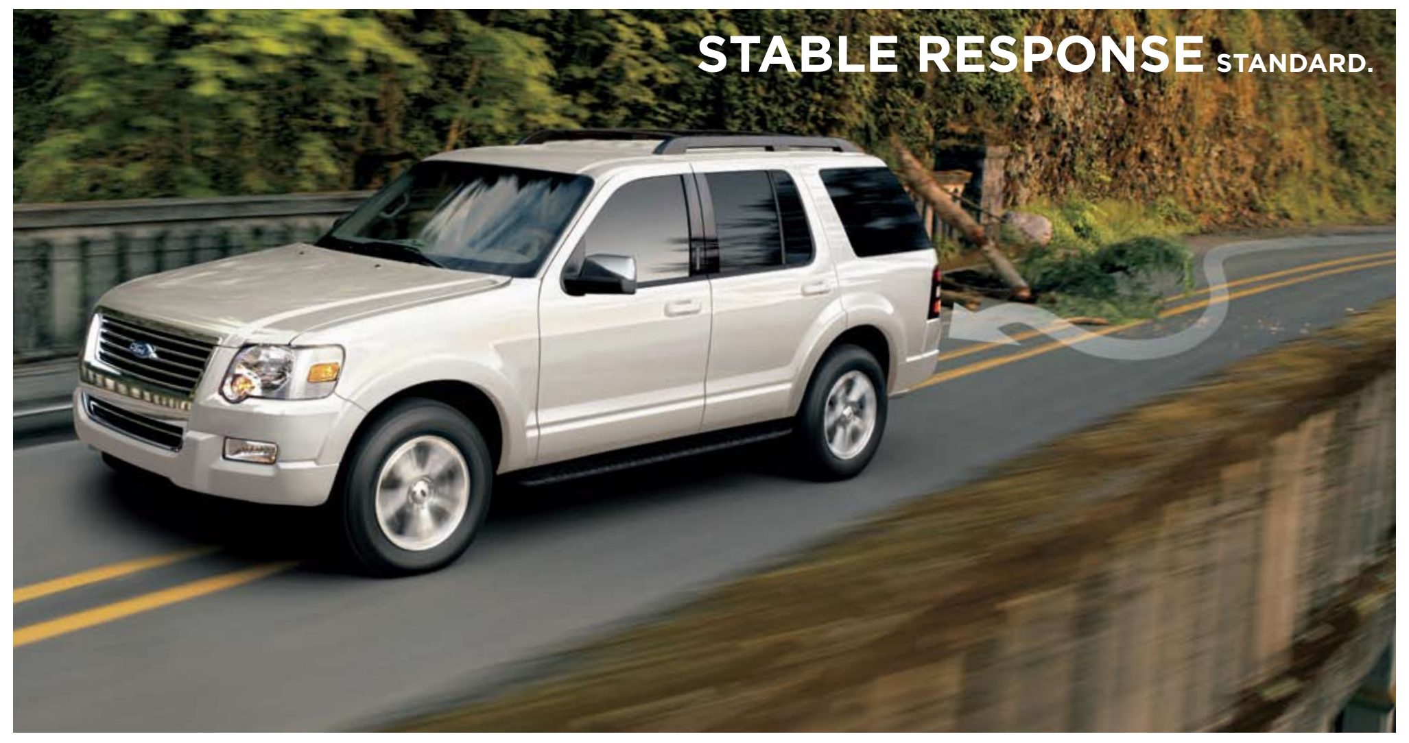
Explorer XLT in White Suede with available equipment.

Standard AdvanceTrac® with RSC® (Roll Stability Control™) is cutting-edge safety technology. Working with the Anti-lock Brake System (ABS), traction control and yaw control, it automatically determines how to apply braking and engine power to help keep all 4 wheels firmly planted! Just one more way Explorer can help you handle things beyond your control.