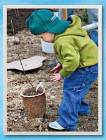
helped plant more than 71,000 trees in Canada over the last 5 years.

As the world's largest engine manufacturer, Honda has a proud tradition of turning innovative ideas into products that help make Canada and the world around us brighter and a little more fun. These products are equipped with some of the cleanest, most fuel-efficient engines you'll find on the road, in the water or high above the clouds. And as technically ingenious as these products are, they are all brought to life by The Power of Dreams<sup>®</sup>.