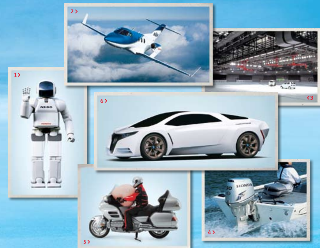
1> ASIMO™, the advanced life-assisting humanoid robot 2> The high-speed, fuel-efficient HondaJet™ 3> Honda's advanced safety research and development facility in Tochigi, Japan 4> First manufacturer of a full line of cleaner 4-stroke outboard motors 5> The world's first motorcycle safety airbag 6> The Honda FC Sport, our advanced hydrogen fuel-cell concept vehicle

As the world's largest engine manufacturer, Honda has a proud tradition of turning innovative ideas into products that help make Canada and the world around us brighter and a little more fun. These products are equipped with some of the cleanest, most fuel-efficient engines you'll find on the road, in the water or high above the clouds. And as technically ingenious as these products are, they are all brought to life by The Power of Dreams®.