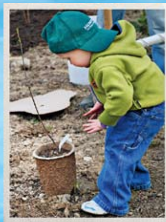
Honda associates and families have helped plant more than 71,000 trees in Canada over the last 5 years.

As the world's largest engine manufacturer, Honda has a proud tradition of turning innovative ideas into products that help make Canada and the world around us brighter and a little more fun. These products are equipped with some of the cleanest, most fuel-efficient engines you'll find on the road, in the water or high above the clouds. And as technically ingenious as these products are, they are all brought to life by The Power of Dreams®.