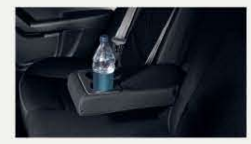
REAR CENTRE ARMREST includes handy cupholders for your passengers. The standard 60:40 split seatbacks also fold down to accommodate oversized cargo when you need the added space.