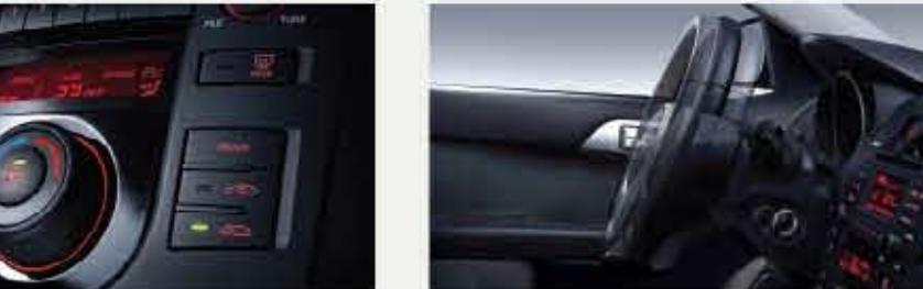
TILT AND TELESCOPING STEERING WHEEL lets you position the wheel precisely where you want it. This controlenhancing comfort feature is standard on EX and SX models.