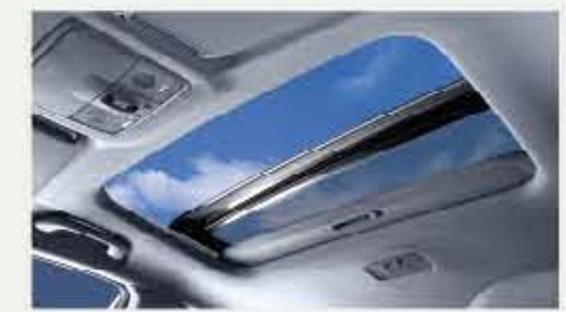
exhilaration of open-air driving. What better way to enjoy a beautiful day? It's standard on SX and optional on EX models.