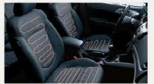
HEATED FRONT SEATS take the chill out of winter driving. They're standard on the EX and SX.