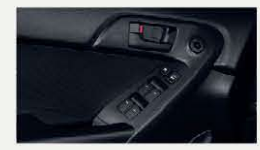
POWER WINDOWS are standard on every Forte. They include a guick and convenient one-touch-down function for the driver's window to help speed you through any