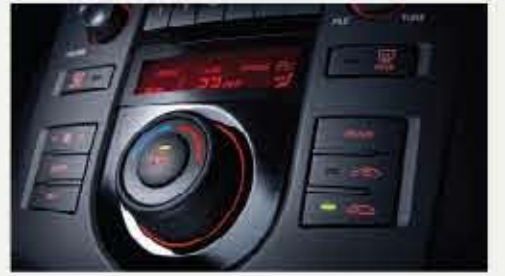
AUTOMATIC CLIMATE CONTROL brings year-round, setand-forget comfort and it's standard equipment on the SX. Manual air conditioning is standard on EX and available on LX models.