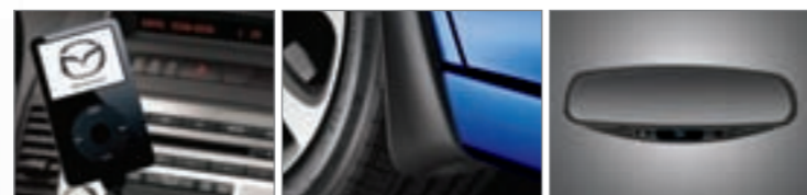
Pictured above from left to right: iPod adapter 3 , Mud guards, Auto-dimming mirror with compass and HomeLink ®