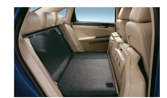
The versatile flip-and-fold-flat rear seats fold down to create an extended loading floor that is 1905 mm (75 in.) in length – more than long enough for oversized items, such as skis. Standard on LTZ, available on LS and LT models.

Impala offers a high level of functionality, beginning with an abundance of space, with available seating for up to six. Its versatility is exemplified by the flip-and-fold-flat rear seats that are standard on LTZ – and the fact Impala offers an available six-passenger seating configuration, unlike 2011 Ford Taurus or 2011 Hyundai Genesis.* The comfort is also noteworthy. Examples can be seen in the standard power six-way driver's seat and the dual-zone climate controls that are included in LT and LTZ models. You can then top it off with the genuine luxury of the available heated power front bucket seats with leatherappointed seating surfaces. Just one more way that Impala exceeds your expectations.