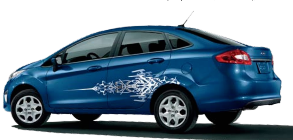
"Fiesta Tattoo" Bodyside Graphics

Ford Licensed Accessories (FLA) are warranted by the accessory manufacturer's limited warranty. The warranty coverage will vary by accessory manufacturer. Ford Licensed Accessories are fully designed and developed by the accessory manufacturer and have not been designed or tested to Ford Motor Company engineering requirements. Contact your local Ford of Canada Dealer for details regarding the accessory manufacturer's limited warranty and/or for a copy of the FLA product limited warranty offered by the accessory manufacturer.