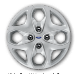
15-in. Steel Wheels with Covers Standard