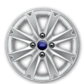
15-in. Painted-Aluminum Wheels Included with Sport Appearance Package