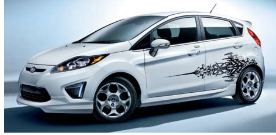
Body Kit by 3dCarbon, @2,3 LED Parking Lamps and "Fiesta Tattoo" Bodyside Graphics

THULE is a registered trademark of Thule Sweden AB.