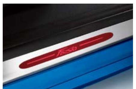
Illuminated Door Sill Plates