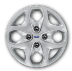
15-in. Steel Wheels with Covers Standard

Interior: • Charcoal Black cloth with Light Stone inserts