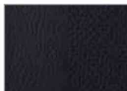
Black Leather / Red Cloth Inserts